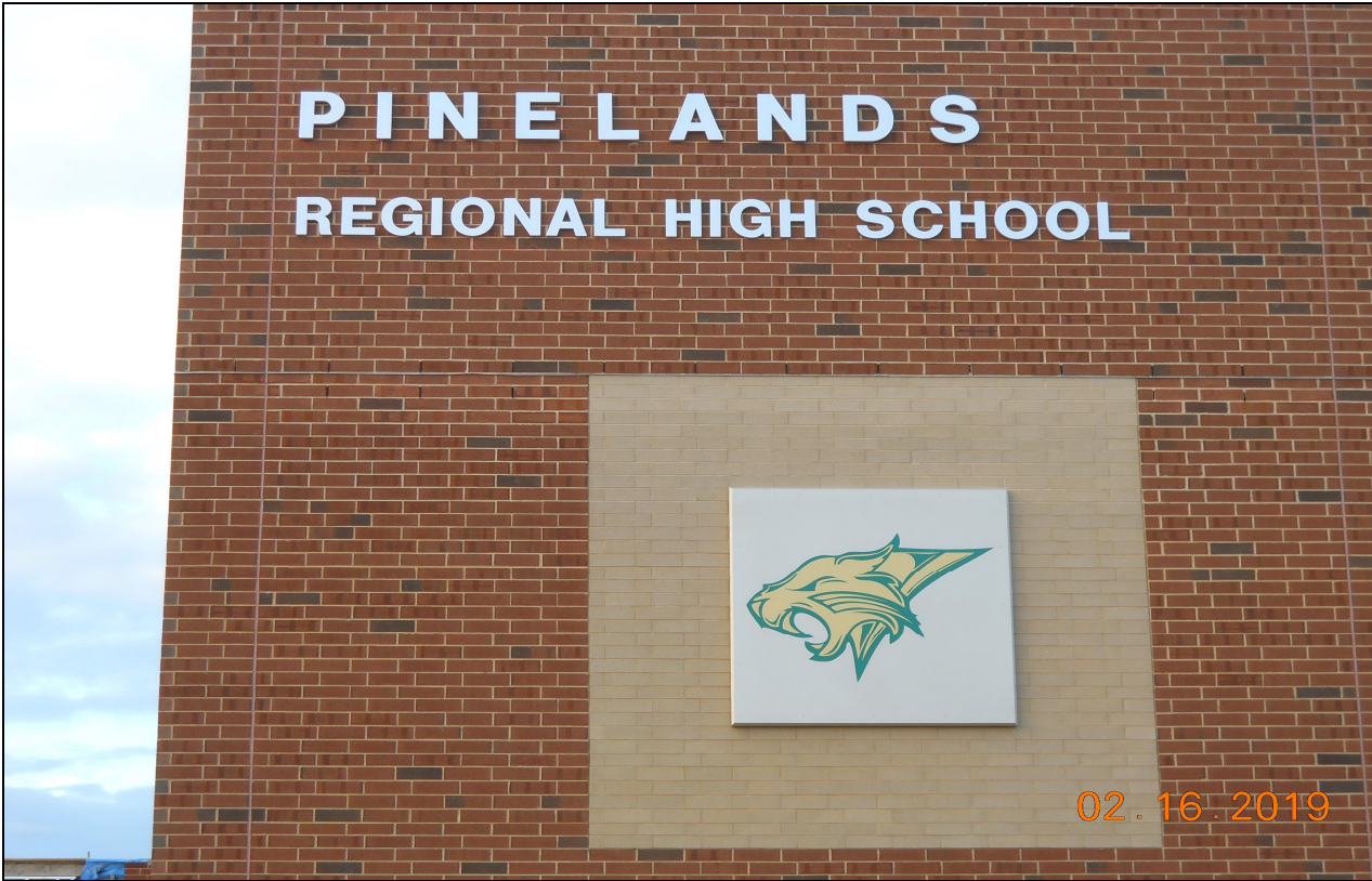
Pinelands Regional Sr. High School 6 New Exterior Signage