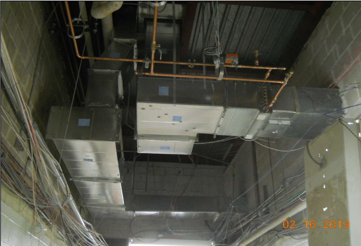
Pinelands Regional Sr. High School 6 Corridor HVAC Ductwork (D-Block)