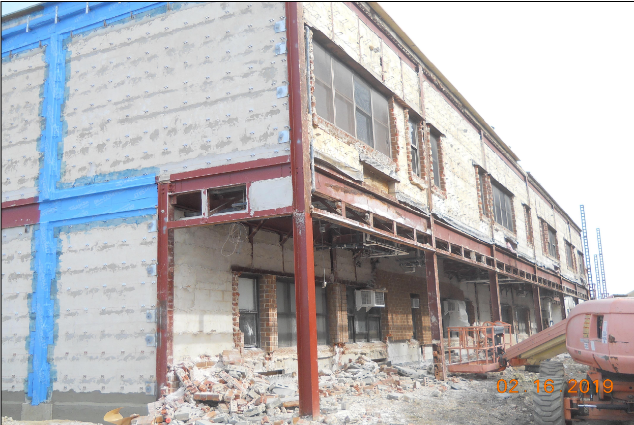
Pinelands Regional Sr. High School 6 Exterior Masonry Facia Demolition & Preparation (A Block - South)