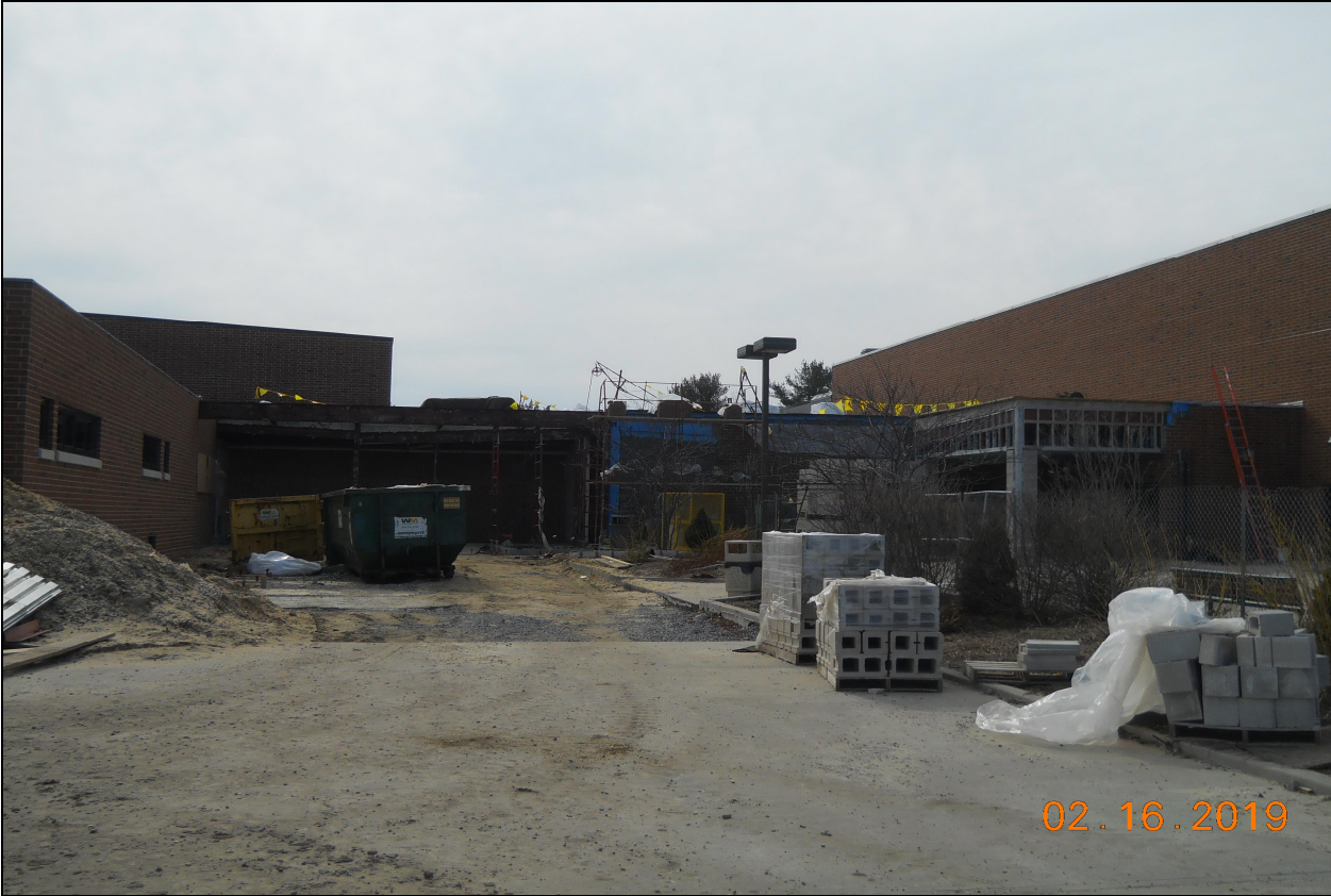
Pinelands Regional Sr. High School 6 Exterior Masonry Installation (Main Entrance)