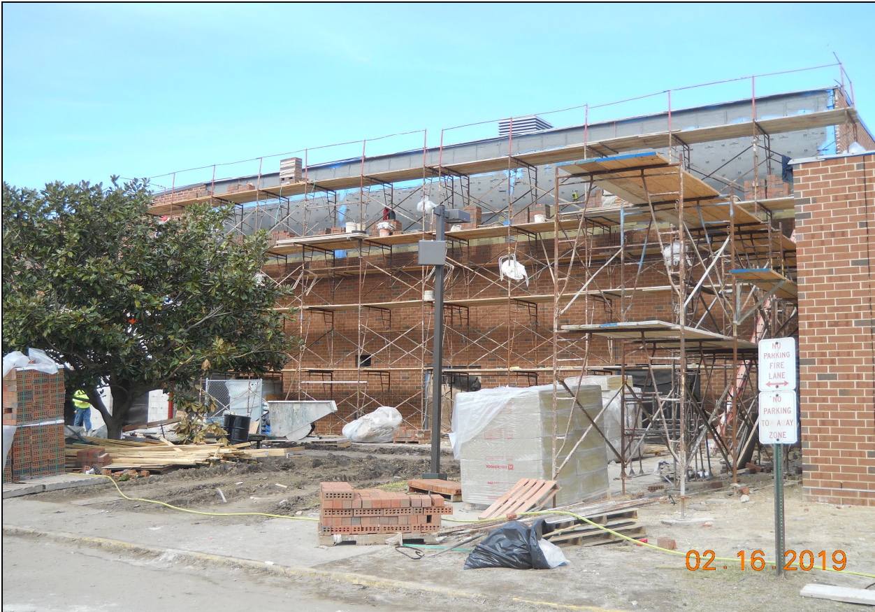
Pinelands Regional Sr. High School 6 Exterior Masonry Installation (West D-Block & Auditorium)