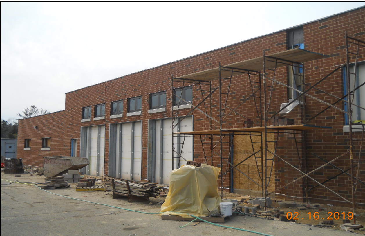
Pinelands Regional Sr. High School 6 Exterior Masonry & Windows / Doors (D-Wing East 6 Auto Shop)