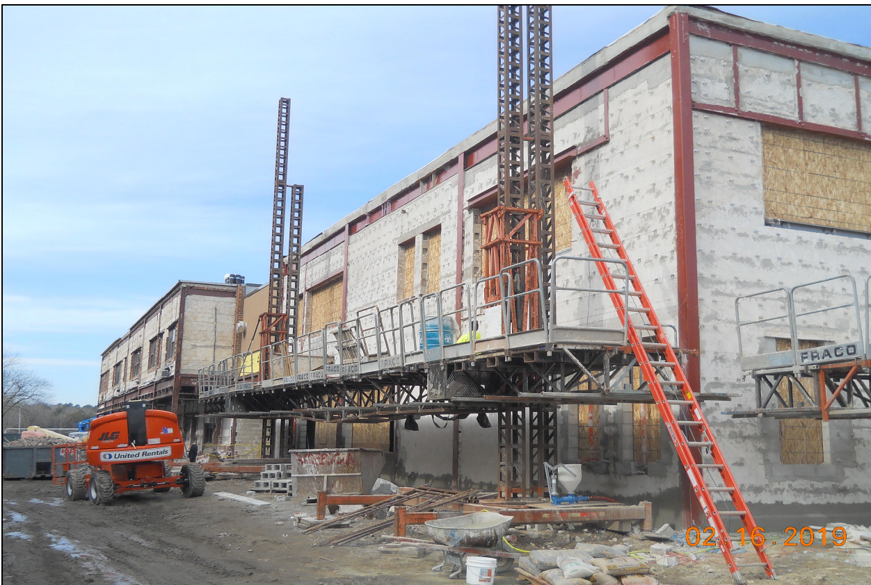
Pinelands Regional Sr. High School 6 Exterior Masonry Reconstruction & Preparation (C Block 6 Media Center)