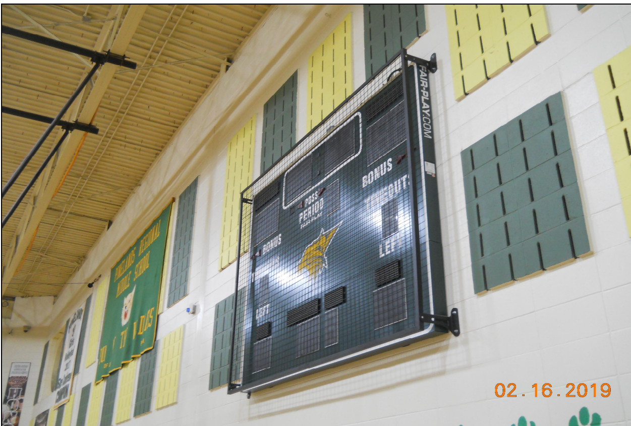
Pinelands Regional Jr. High School 6 Gym Scoreboard Protection Guard