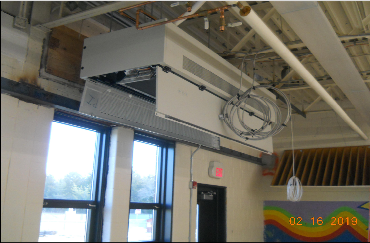
Pinelands Regional Sr. High School ó HVAC Unit óArt Classroomö (D-Block)