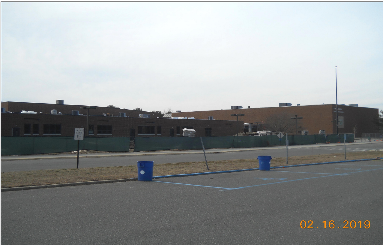
Pinelands Regional Sr. High School 6 Exterior Masonry/Windows/Doors- Installation (Front Elevation)