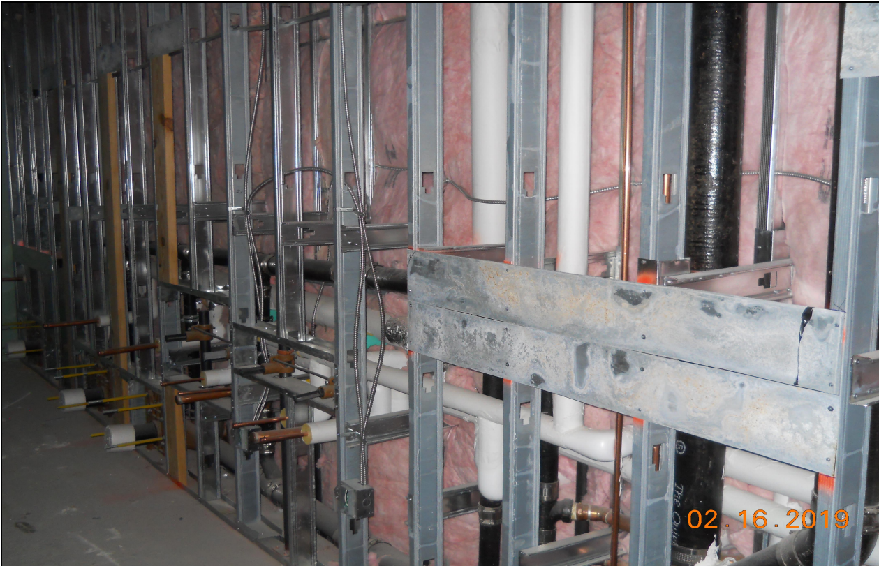
Pinelands Regional Sr. High School óBathroom Plumbing /Framing / Insulation (A Block North ó 1 st Floor)