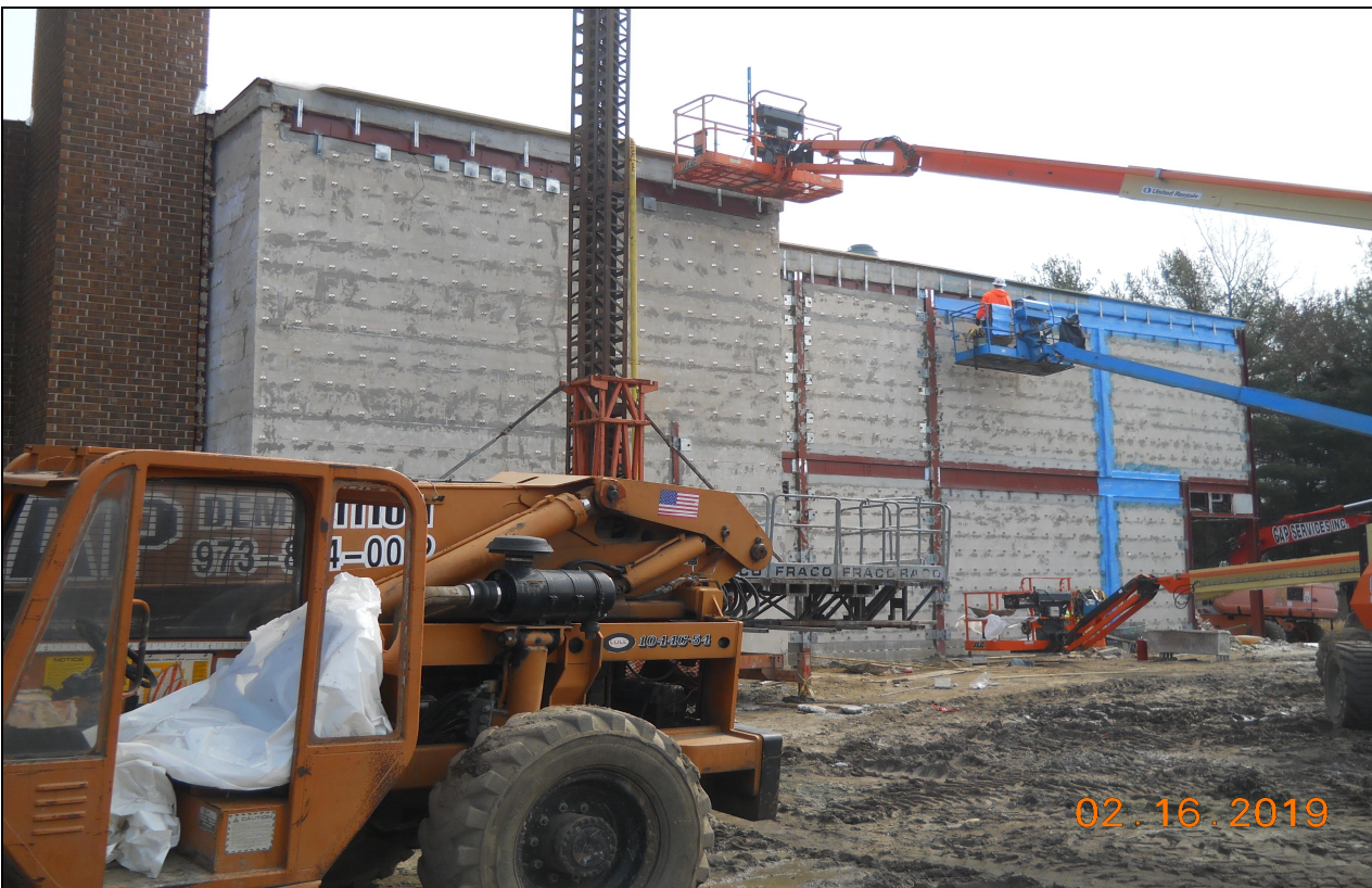
Pinelands Regional Sr. High School 6 Exterior Masonry Preparation (A Block - West)