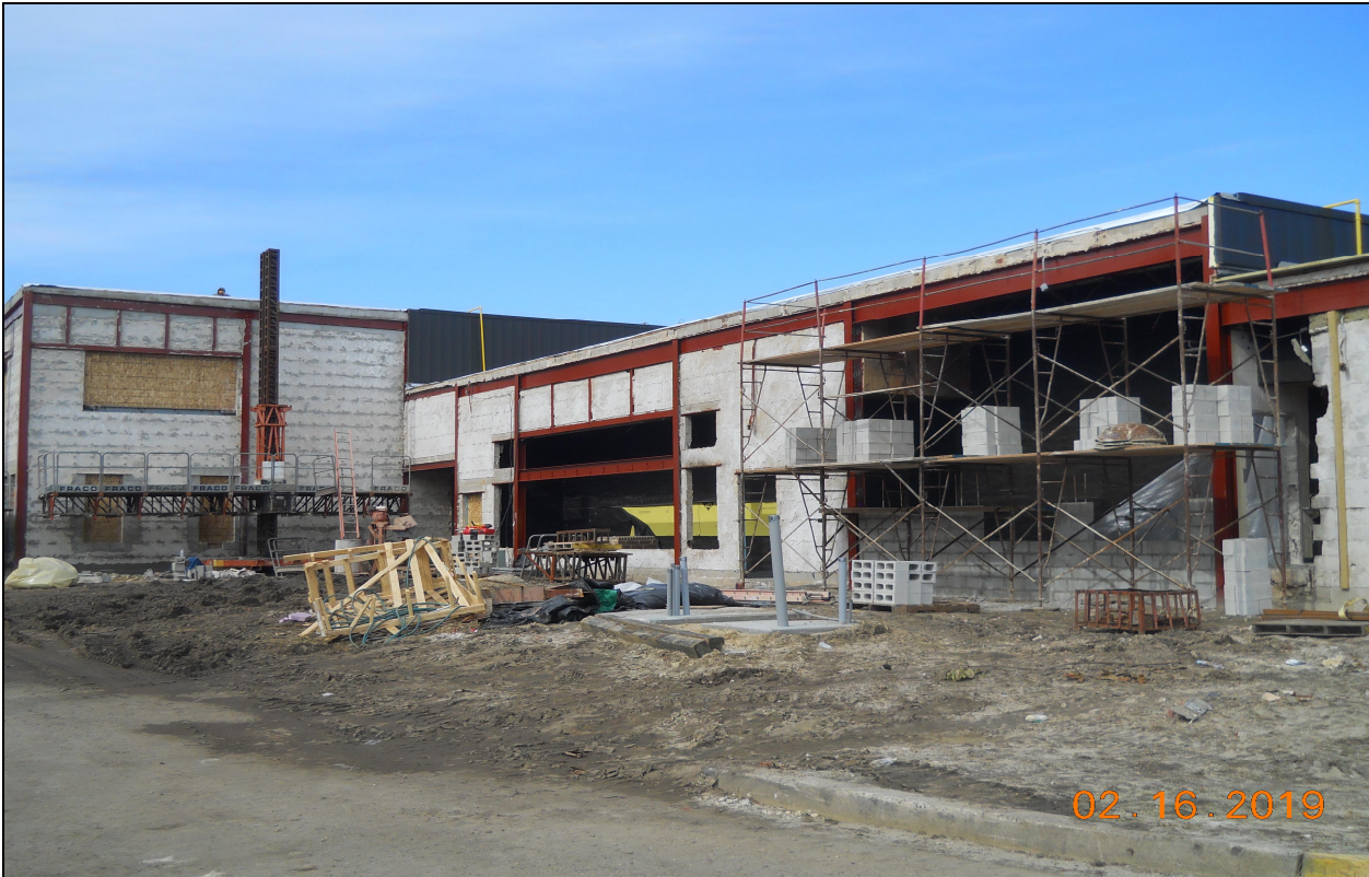
Pinelands Regional Sr. High School 6 Exterior Masonry Reconstruction & Preparation (C Block - Cafeteria)