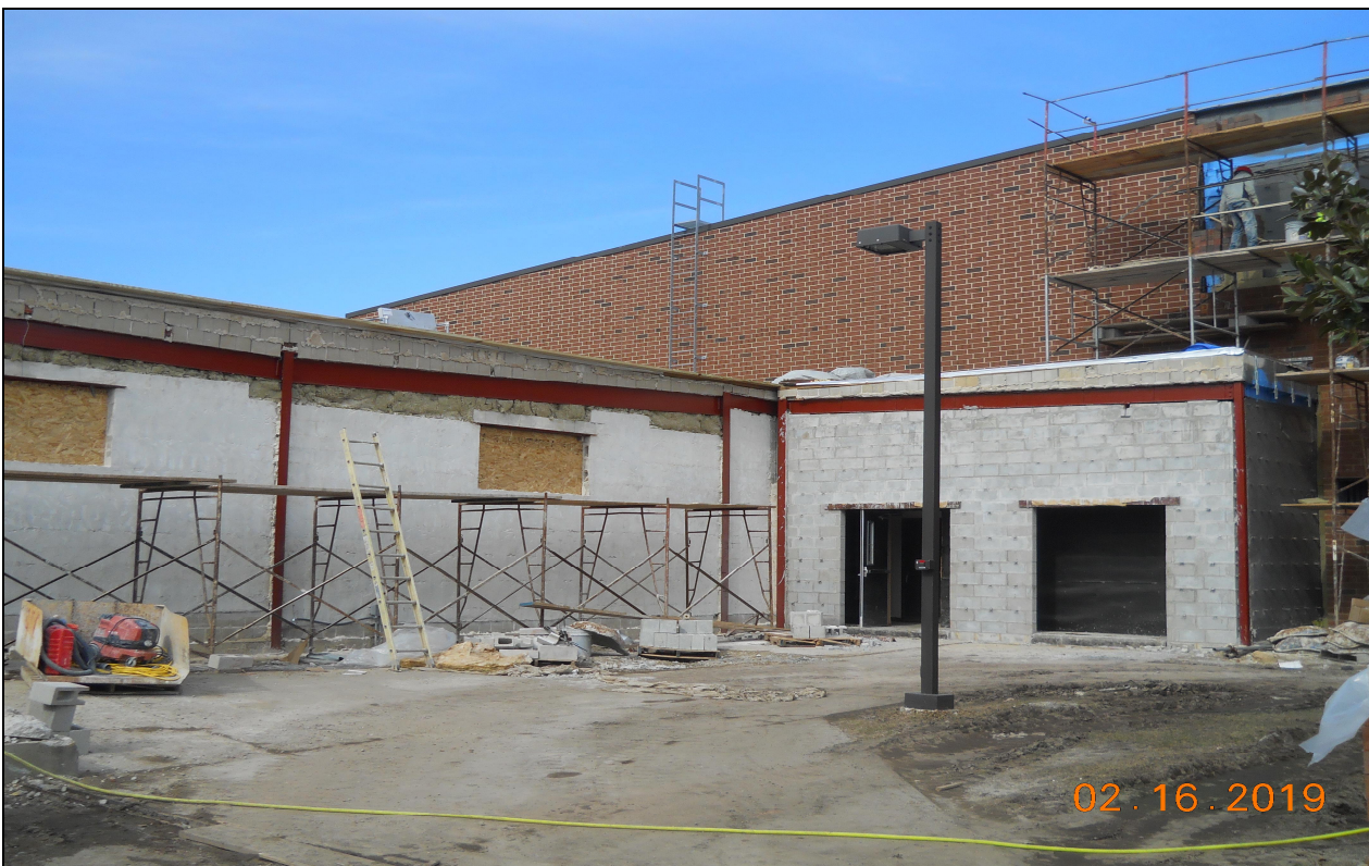
Pinelands Regional Sr. High School 6 Exterior Wall Reconstruction & Preparation (C Block East)