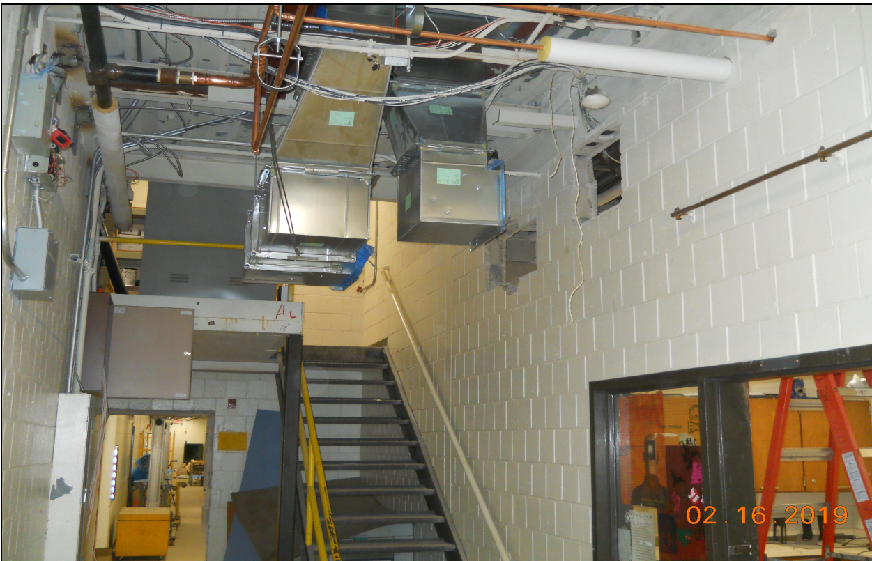
Pinelands Regional Sr. High School 6HVAC Ductwork 6Graphic8 Classroom6 (D-Block)