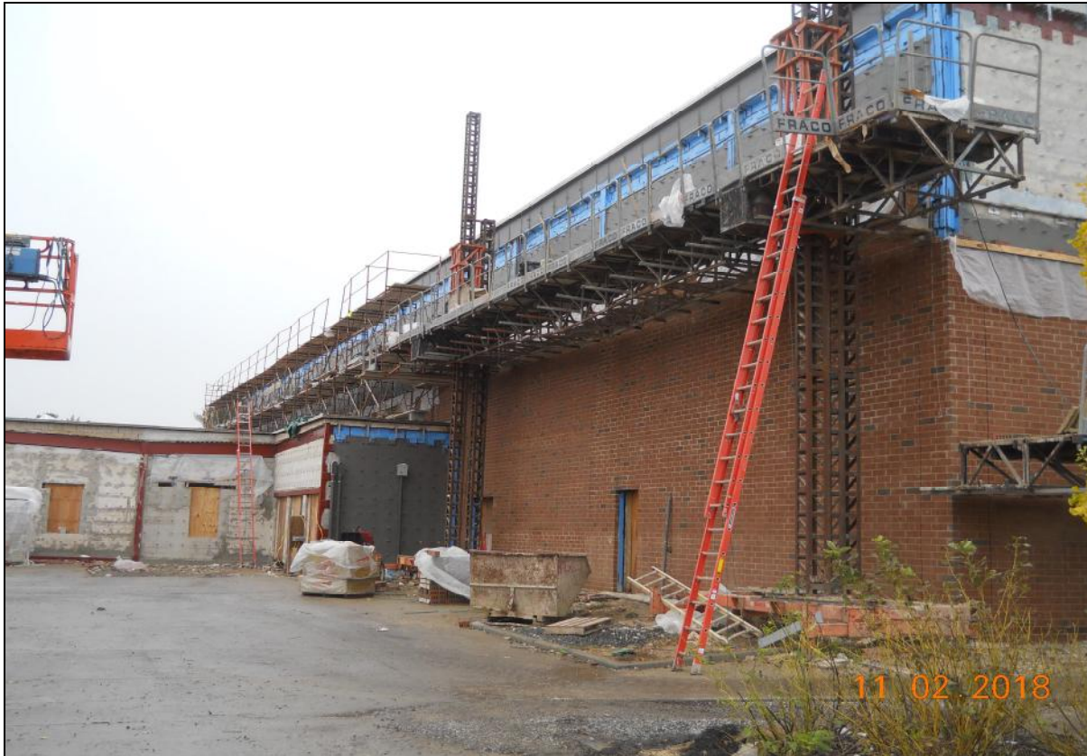
Pinelands Regional Sr. High School 6 Exterior Masonry Waterproofing / Brick Veneer Installation