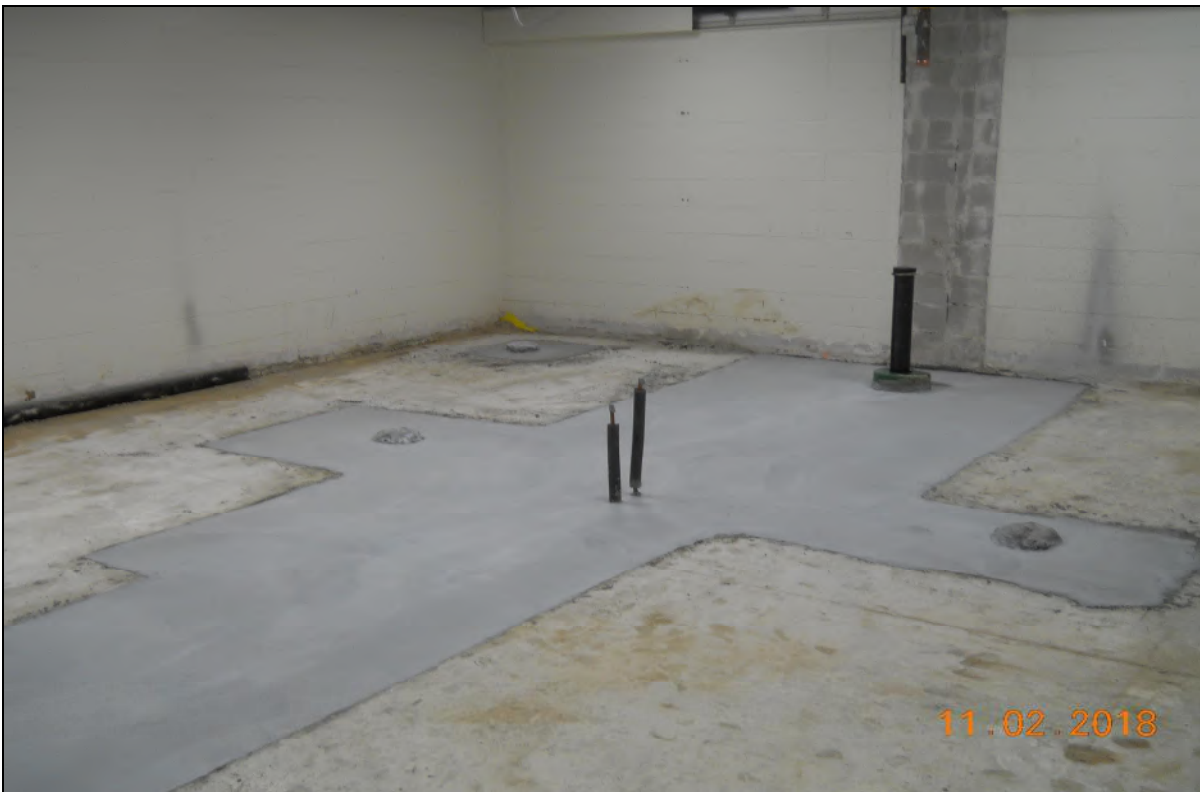
Pinelands Regional Jr. High School 6 1st Floor Boys / Girls Bathroom Concrete Floor Restoration