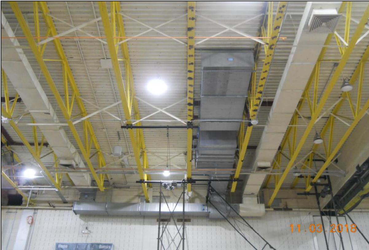
Pinelands Regional Sr. High School 6 New HVAC Ductwork GYM