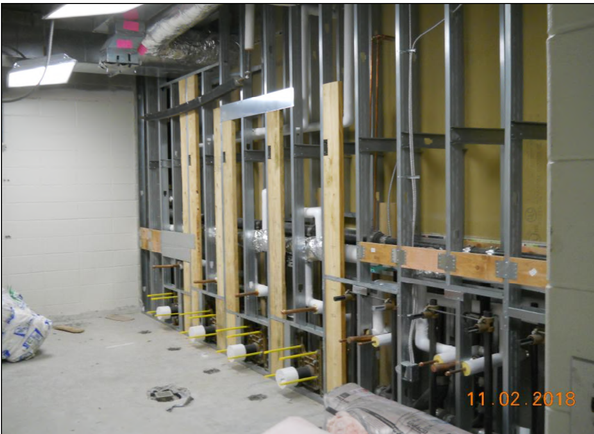
Pinelands Regional Jr. High School 6 th Floor Boys / Girls Bathroom Wall Framing