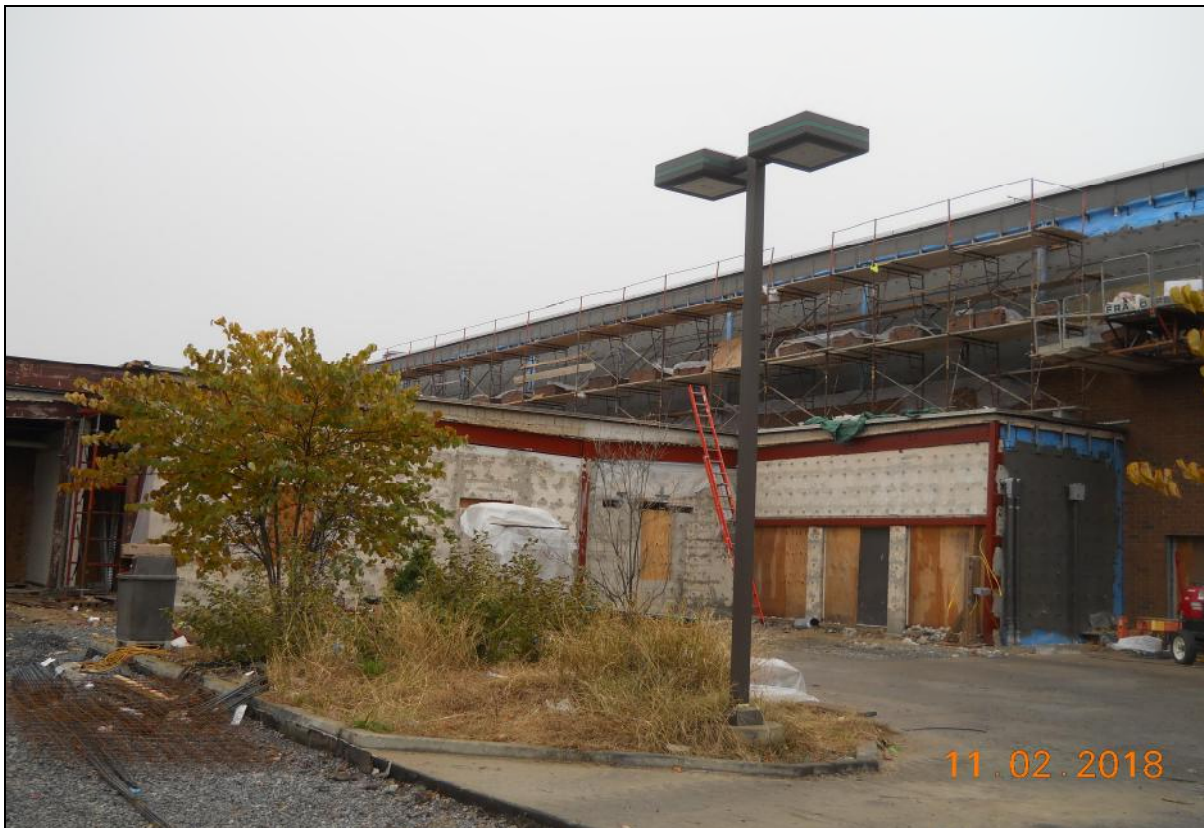
Pinelands Regional Sr. High School 6 Exterior Masonry Waterproofing / Brick Veneer Installation