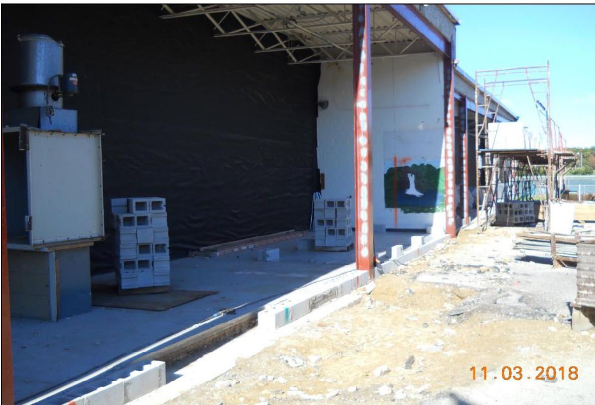
Pinelands Regional Sr. High School 6 Exterior Masonry Wall Layout D-Wing East