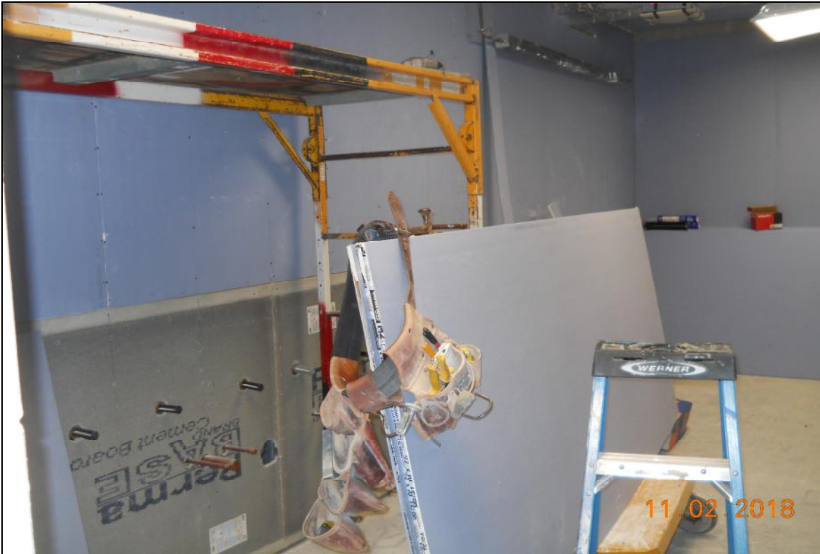
Pinelands Regional Jr. High School 6 th Floor Boys / Girls Bathroom Sheetrock wall