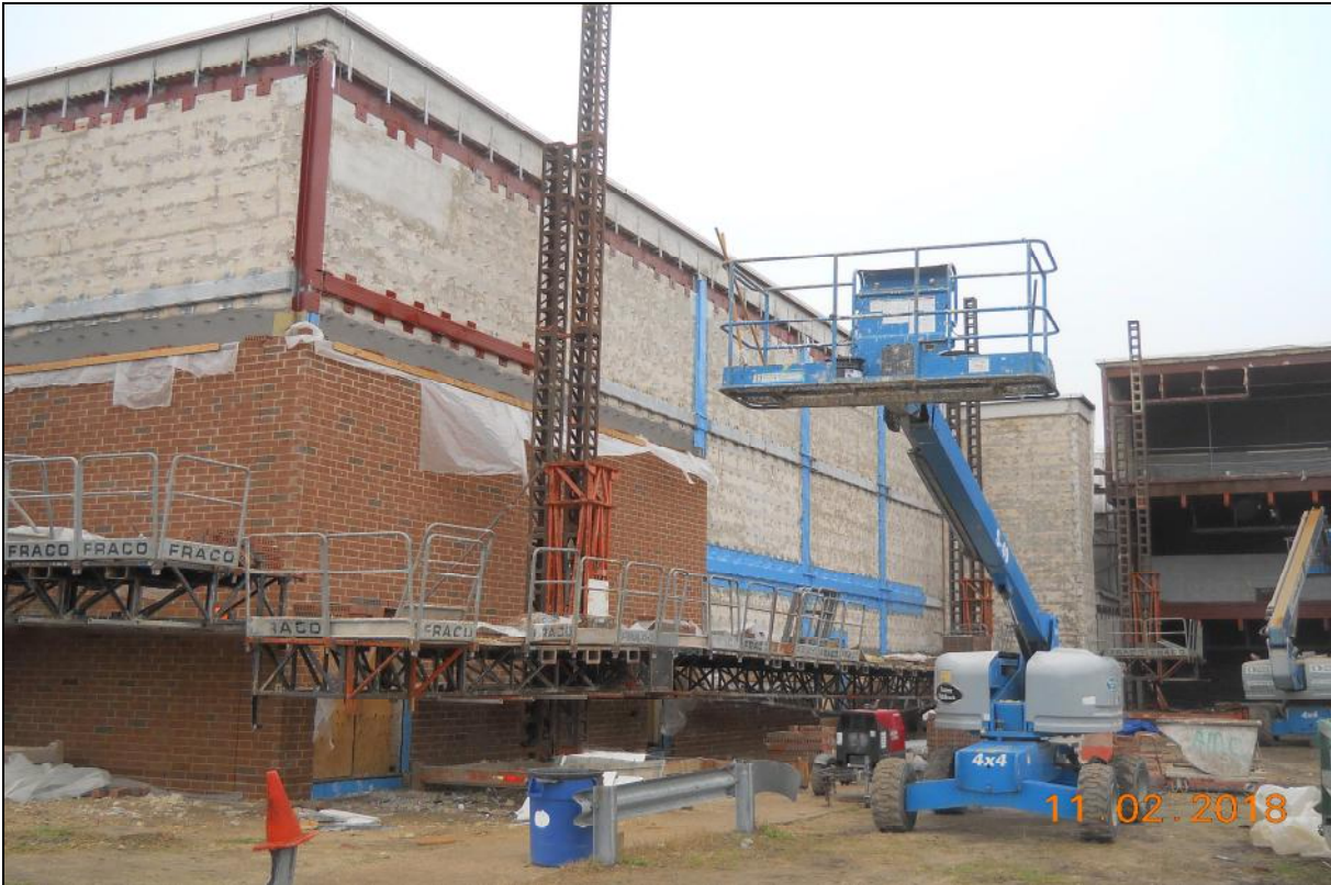
Pinelands Regional Sr. High School 6 Exterior Masonry Waterproofing / Brick Veneer Installation