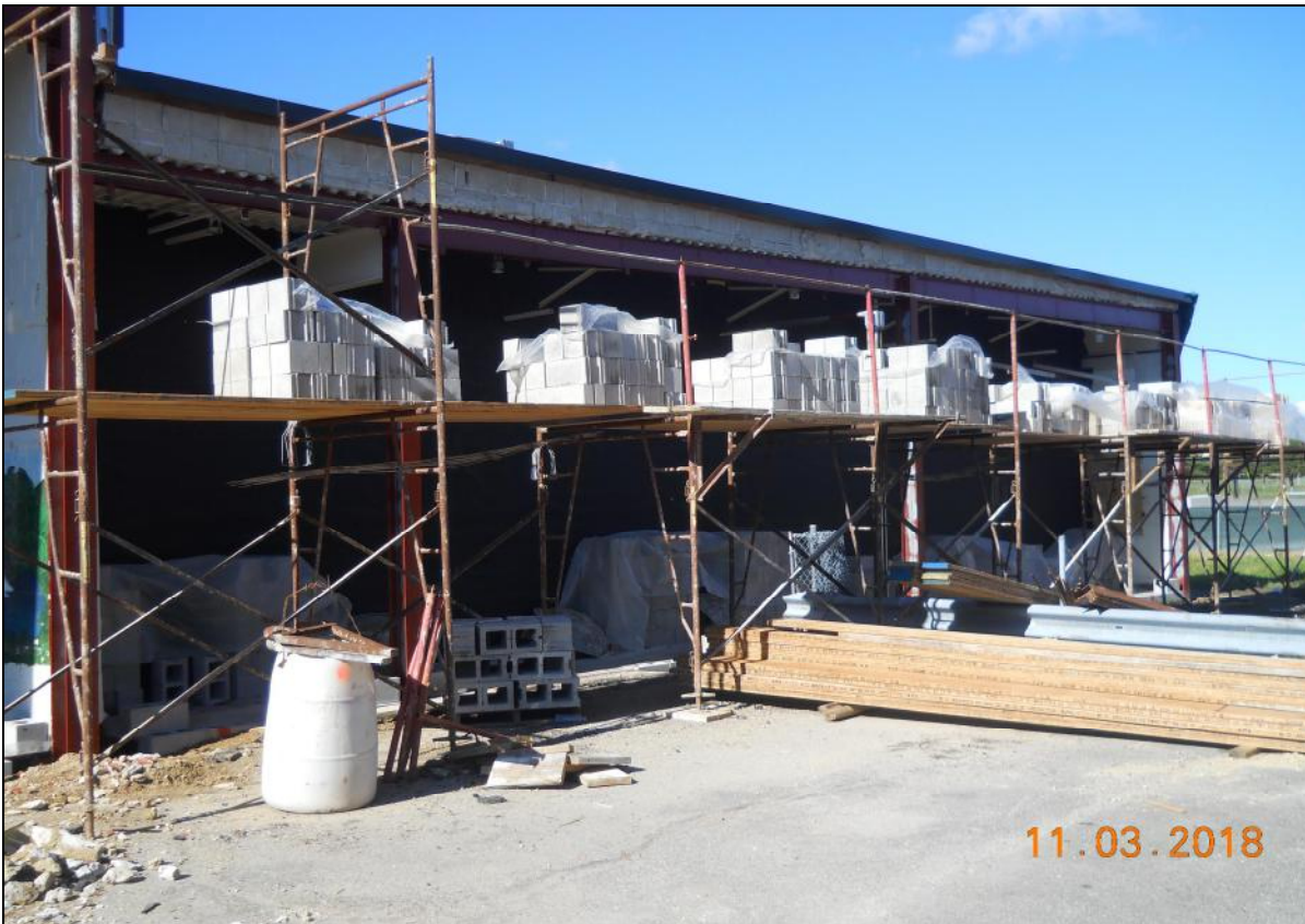
Pinelands Regional Sr. High School 6 Exterior Masonry Wall Installation D-Wing East