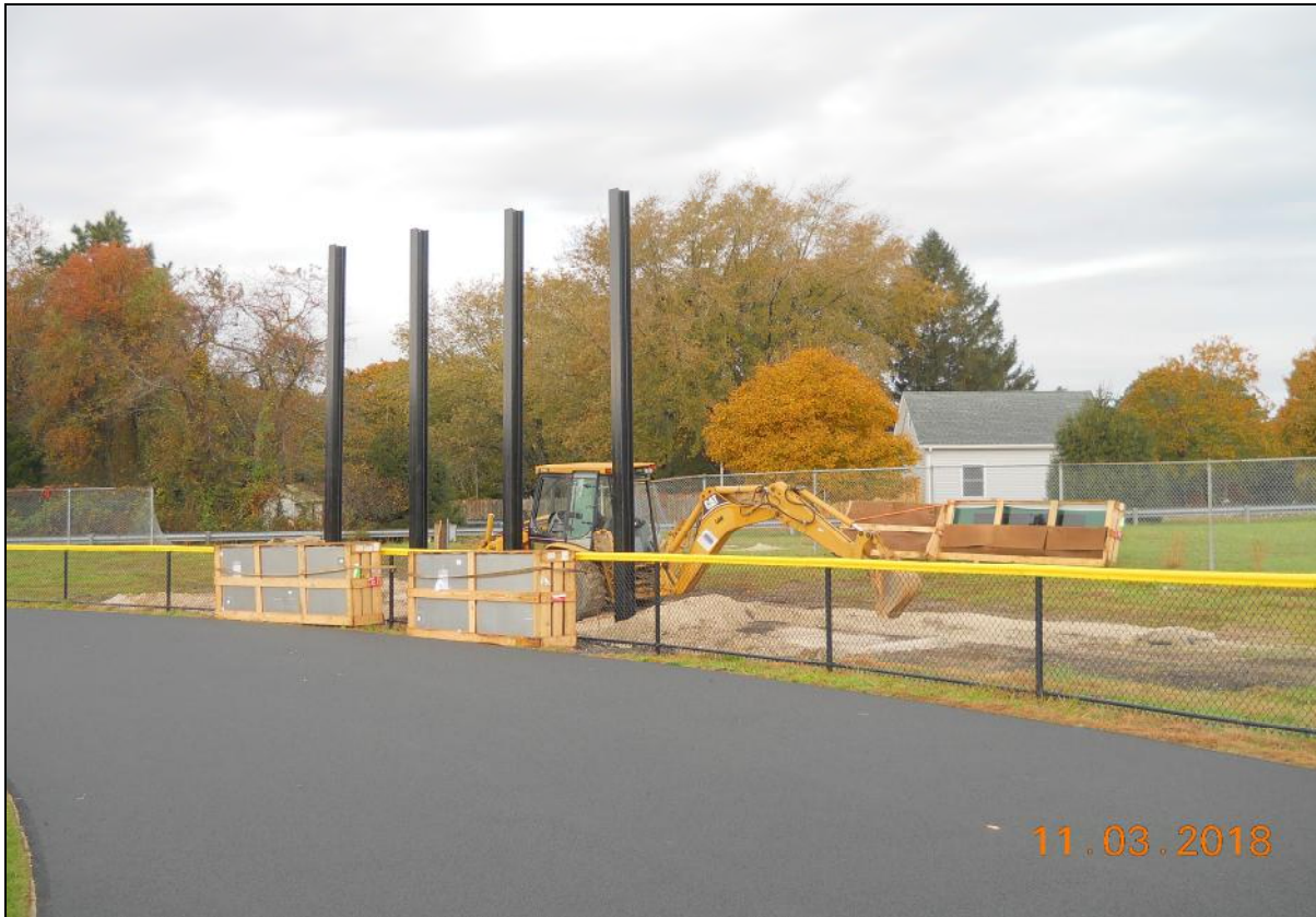
Pinelands Regional Athletic Field 6 Scoreboard Support Columns