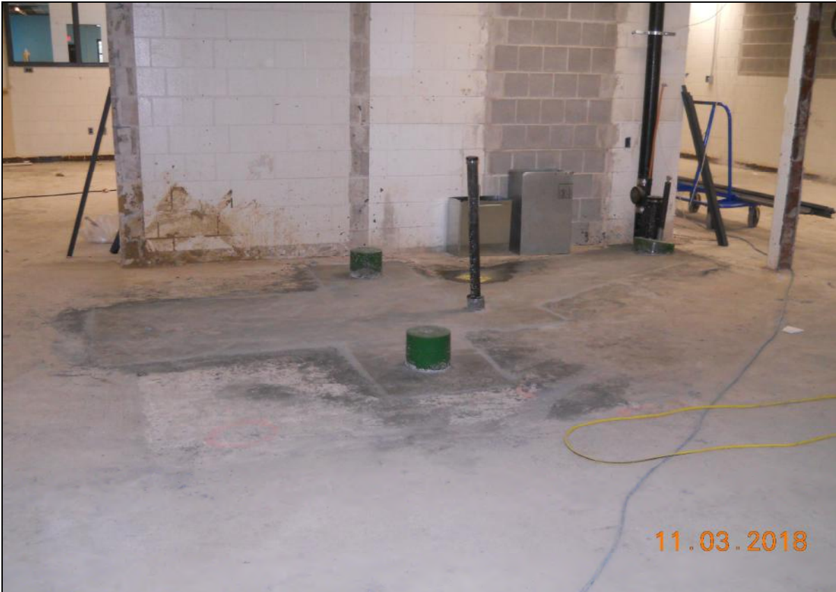
Pinelands Regional Sr, High School 6 Main Office Bathroom Concrete Floor Restoration