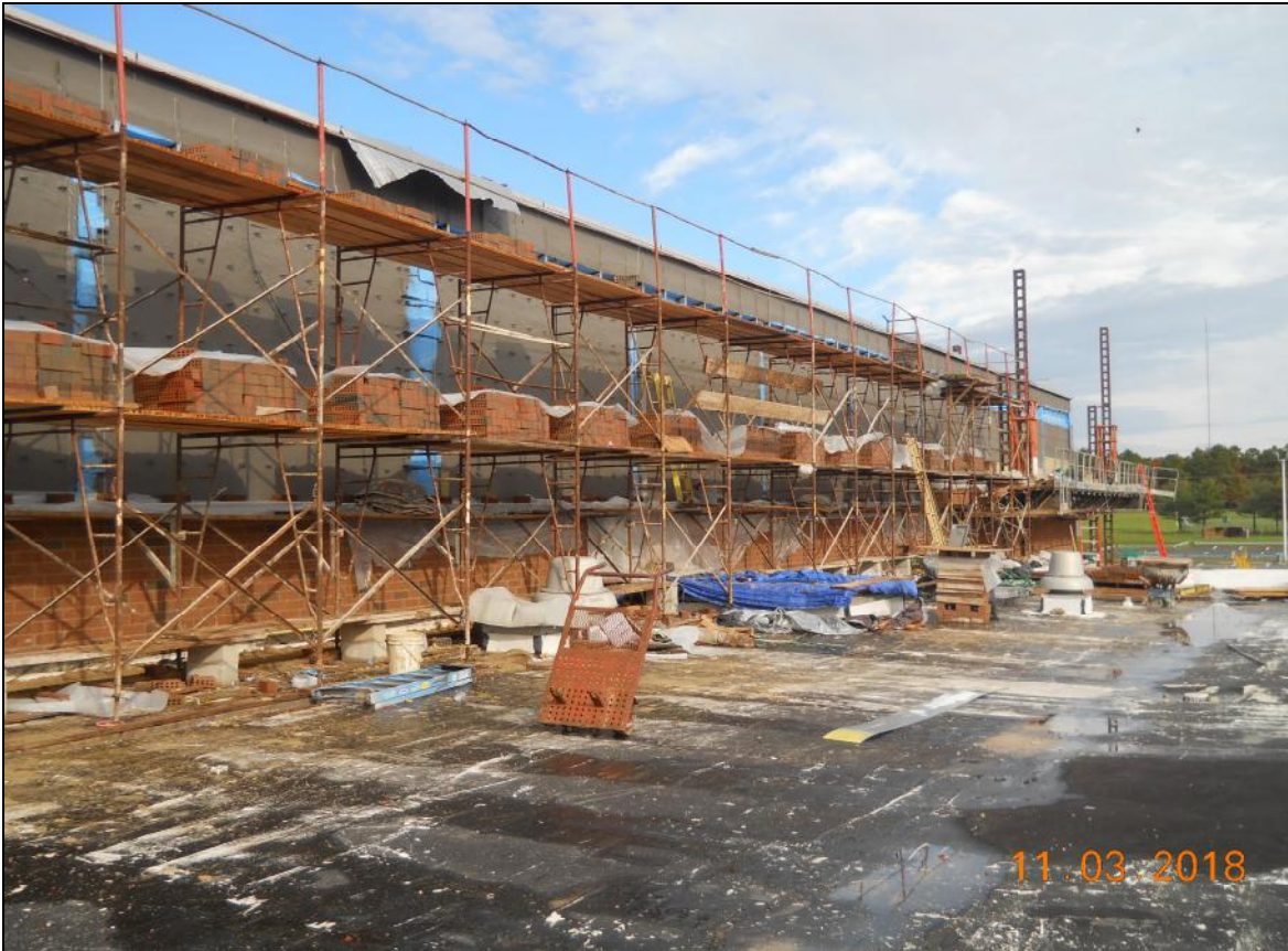
Pinelands Regional Sr. High School 6 Exterior Masonry Waterproofing / Brick Veneer Installation