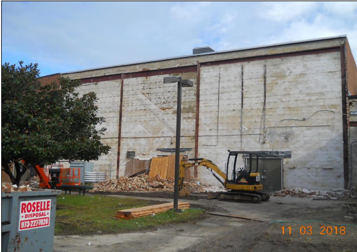
Pinelands Regional Sr. High School 6 Exterior Masonry Facia Demolition Auditorium