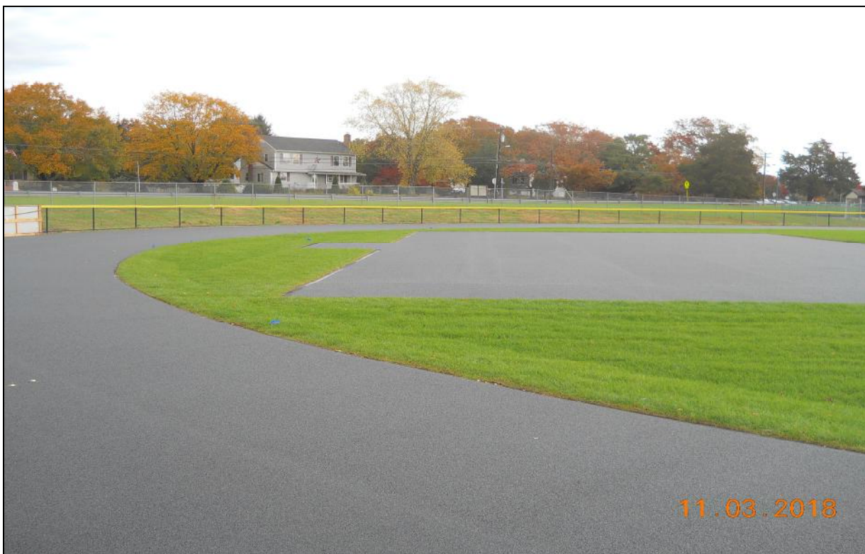
Pinelands Regional Athletic Field 6 Track Base Coat Surface