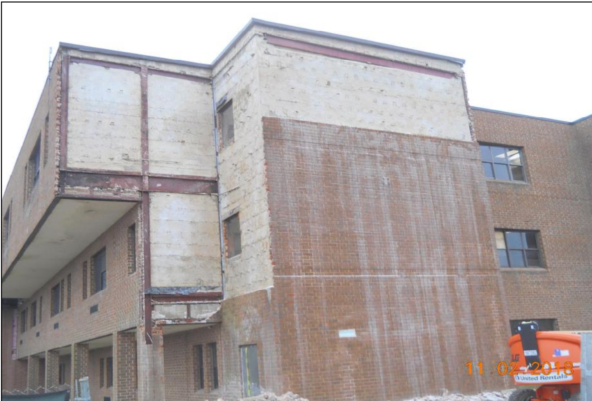
Pinelands Regional Sr. High School 6 Exterior Masonry Facia Demolition A-Wing West