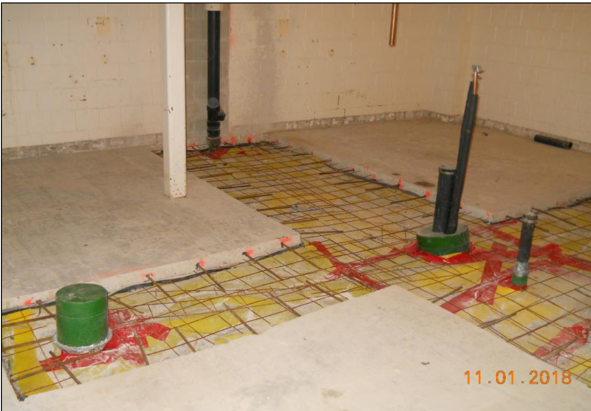
Pinelands Regional Sr. High School 6 Concrete Floor Restoration Prep