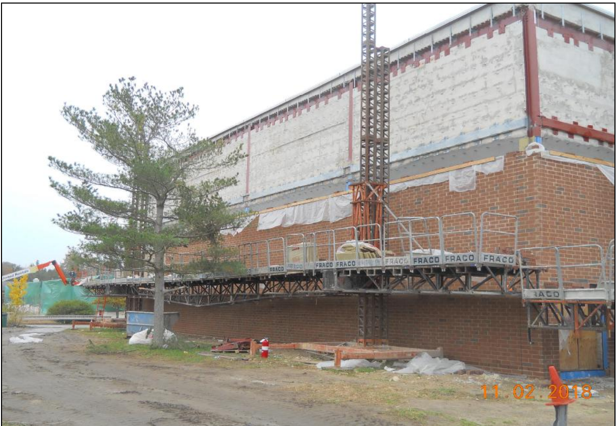
Pinelands Regional Sr. High School 6 Exterior Masonry Waterproofing / Brick Veneer Installation