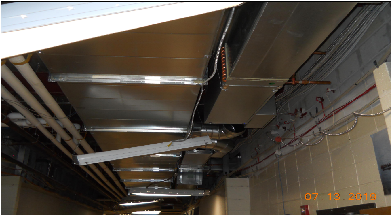
Pinelands Regional Jr. High School 6 HVAC Duct-work Installation (1 st floor C Corridor)