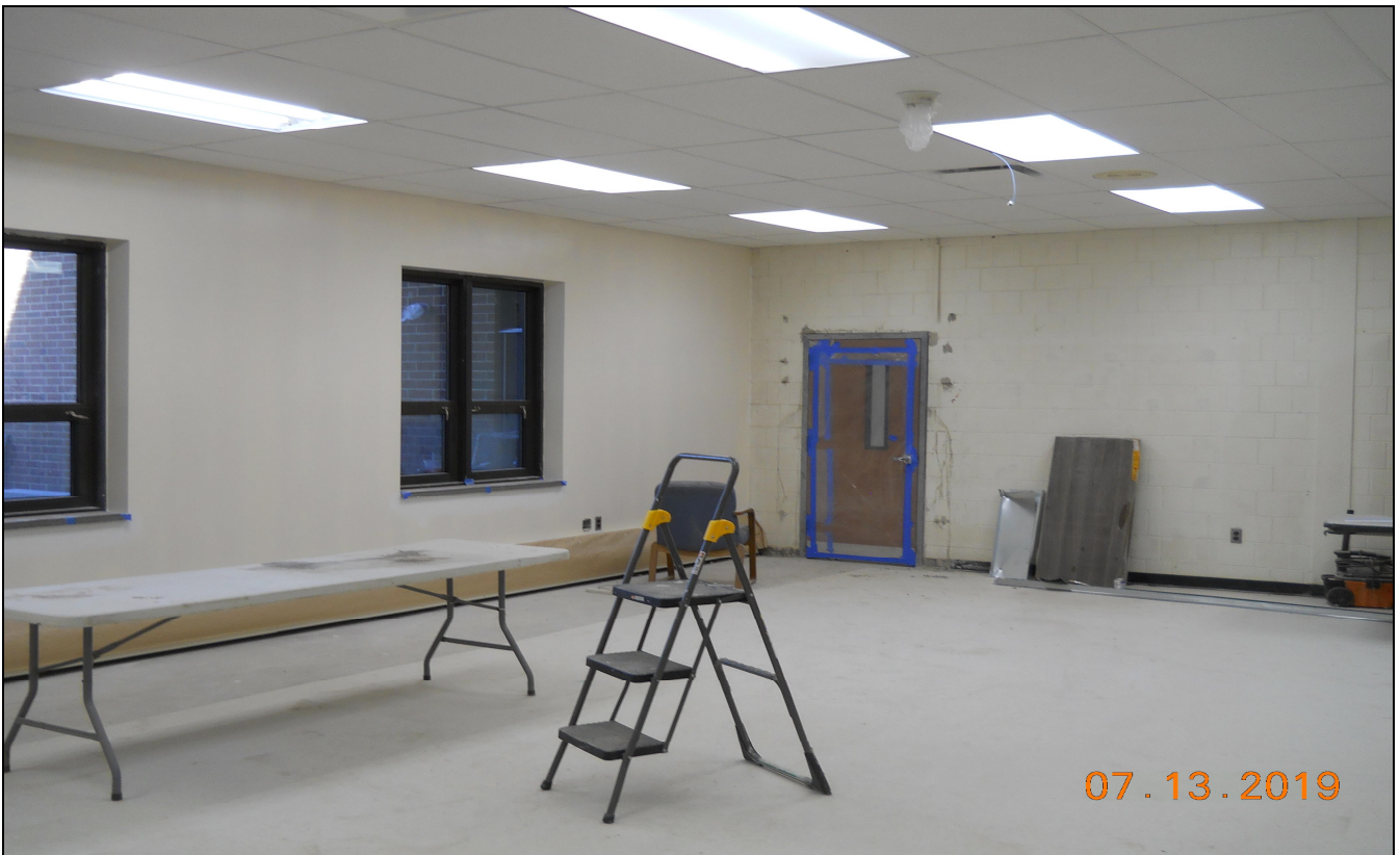
Pinelands Regional Sr. High School 6 Athletic Trainers Room (Block A North 1 st fl.)