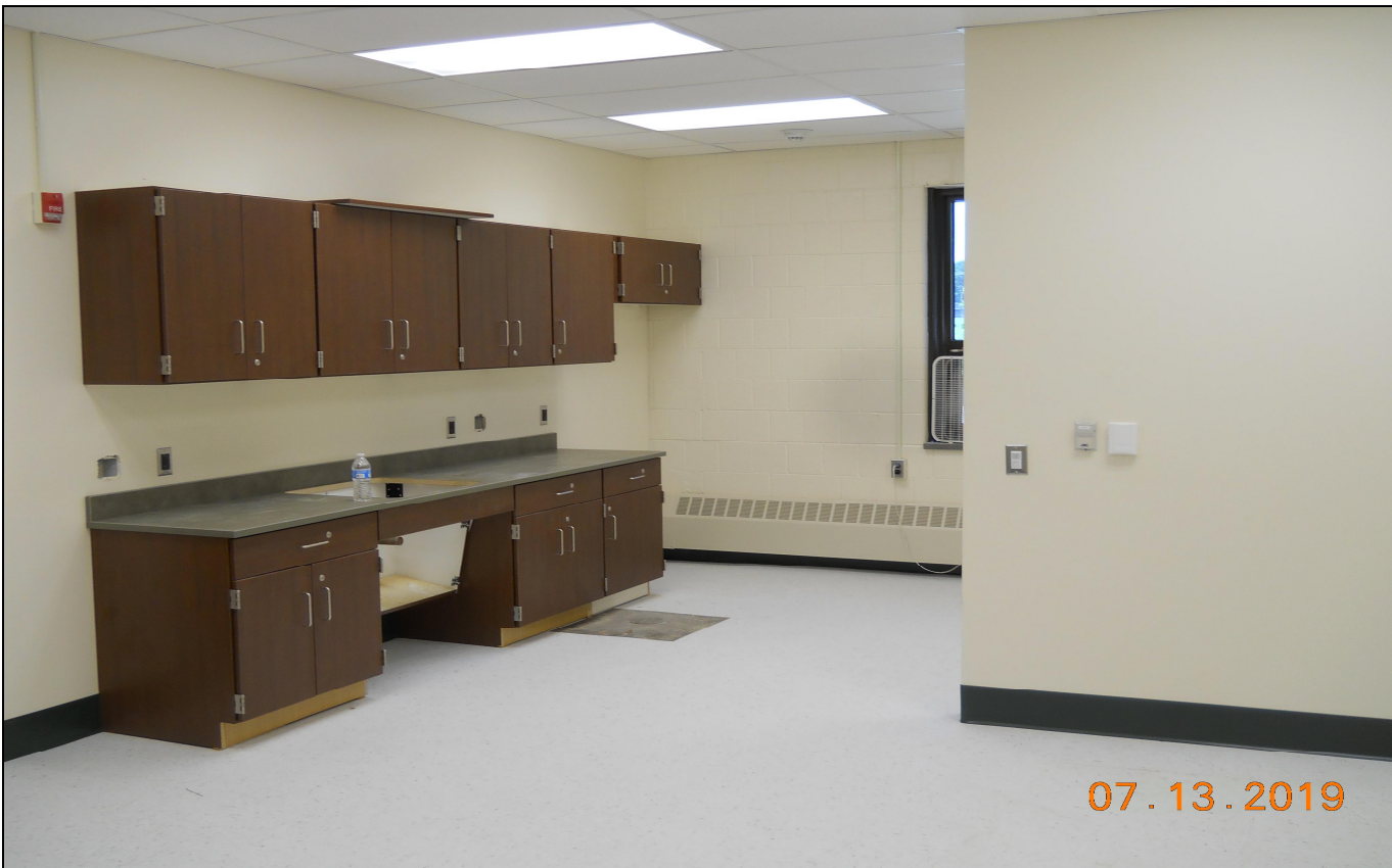
Pinelands Regional Sr. High School 6 Casework Installation (Nurse Suite)