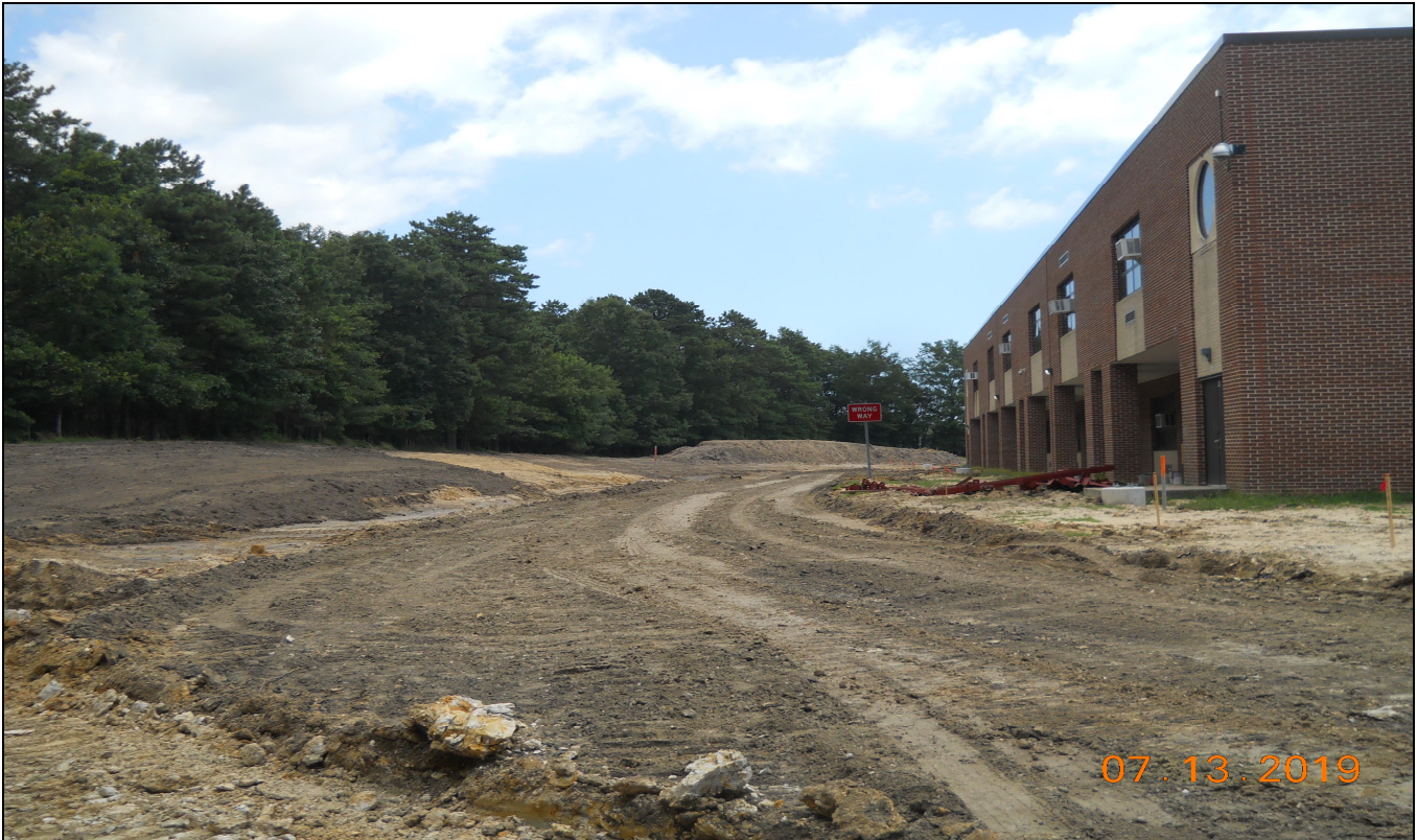
Pinelands Regional Jr. High School 6 Site Preparation Rear Bus Lane