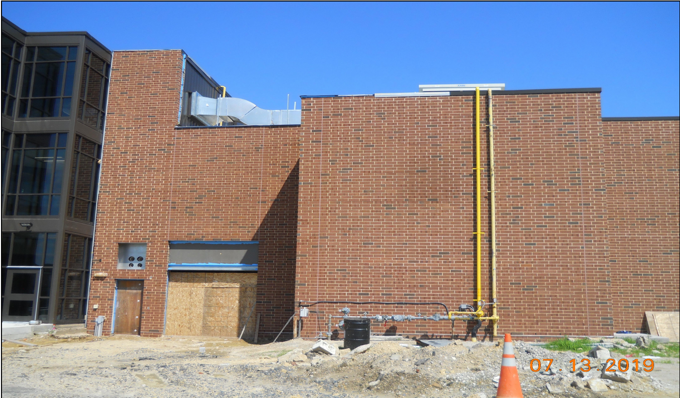
Pinelands Regional Sr. High School 6 Exterior Brick Installation (Block A South 6 Boiler Room)