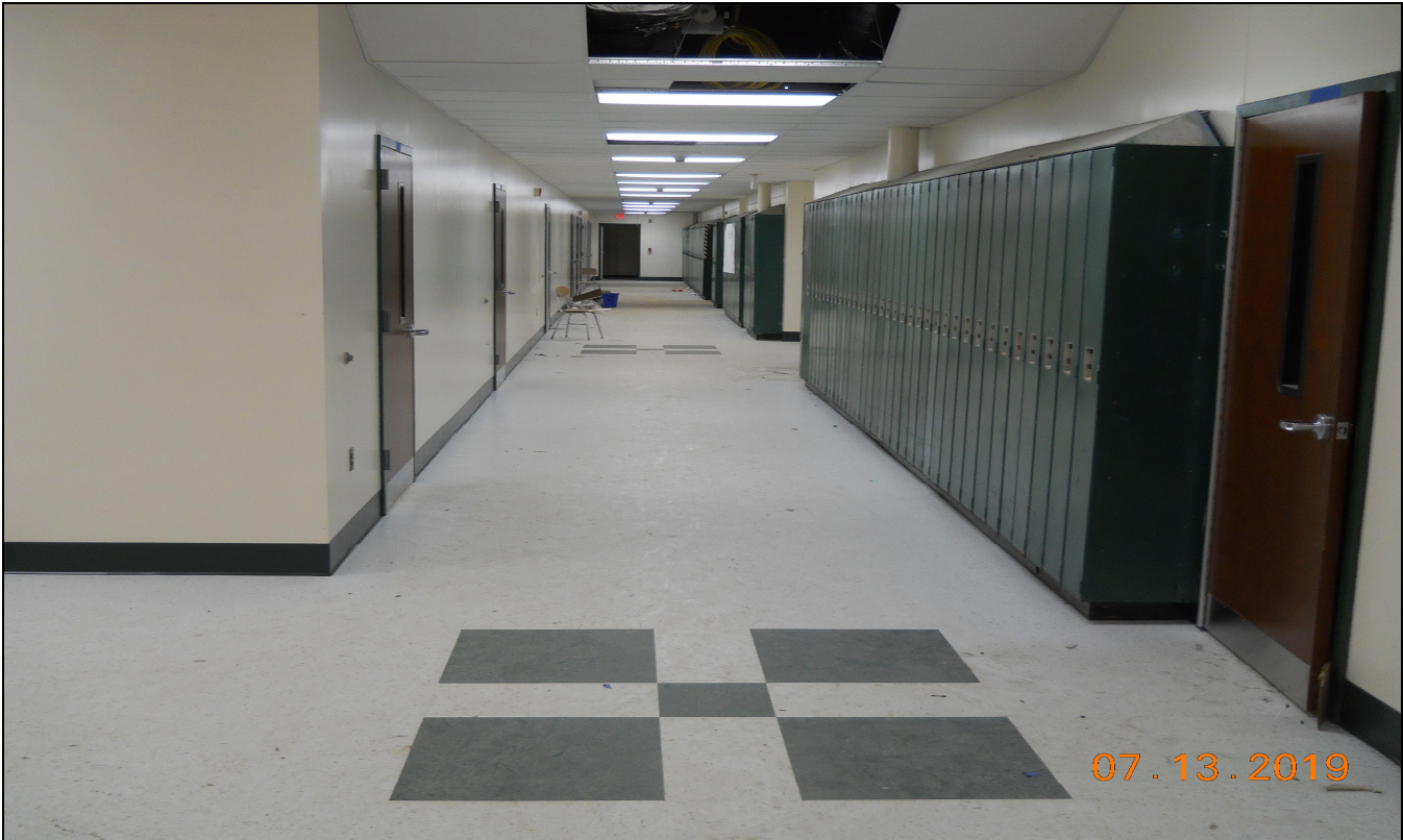
Pinelands Regional Sr. High School 6 Flooring Installation (1 st Floor Block A South)