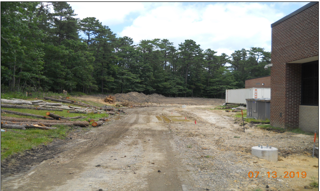
Pinelands Regional Jr. High School 6 Site Preparation Rear Bus Lane