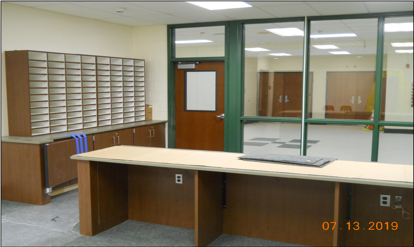
Pinelands Regional Sr. High School 6 Casework Installation (Main Office)