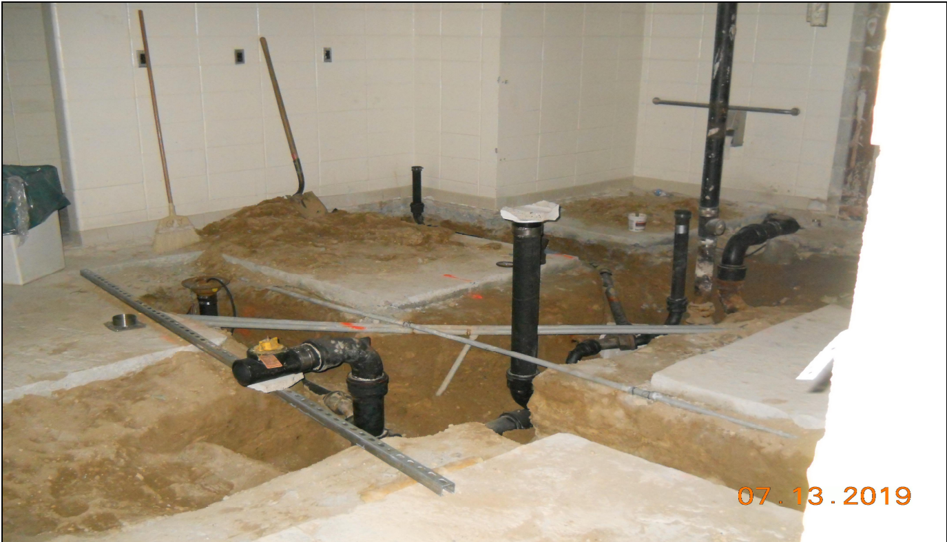
Pinelands Regional Jr. High School 6 Plumbing Rough-in (Locker-Room Bathrooms)