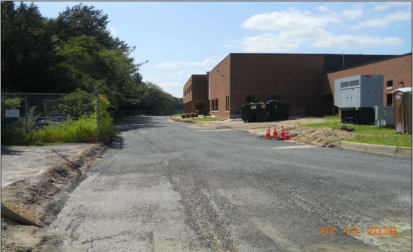
Pinelands Regional Sr. High School 6 Rear Service Road Subgrade Installation