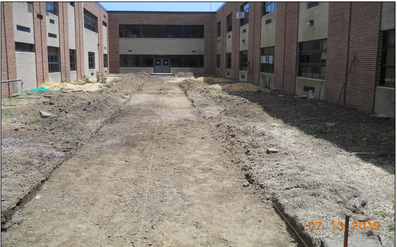
Pinelands Regional Jr. High School 6 Site Preparation (Courtyard Renovation)