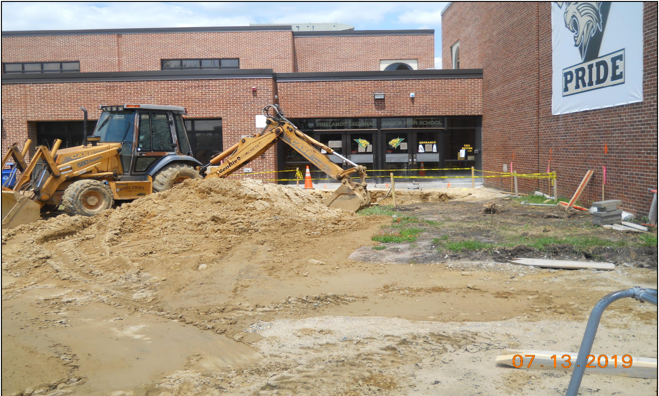
Pinelands Regional Jr. High School 6 Entrance Canopy Foundations