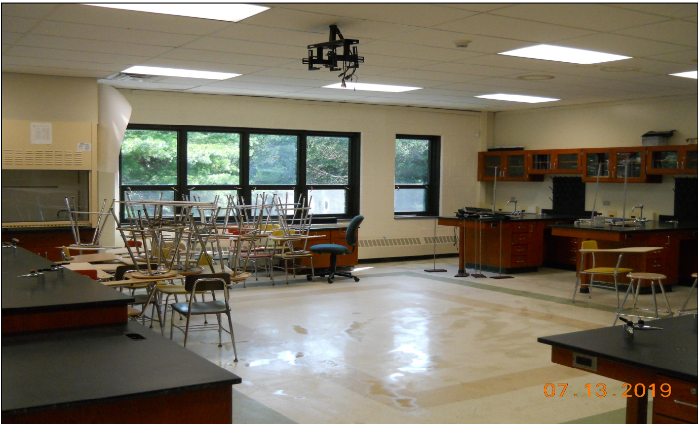
Pinelands Regional Sr. High School 6 Science Classroom (Block A South)