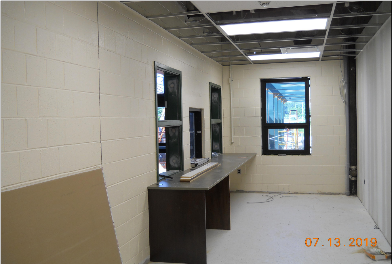
Pinelands Regional Sr. High School 6 Attendance Office