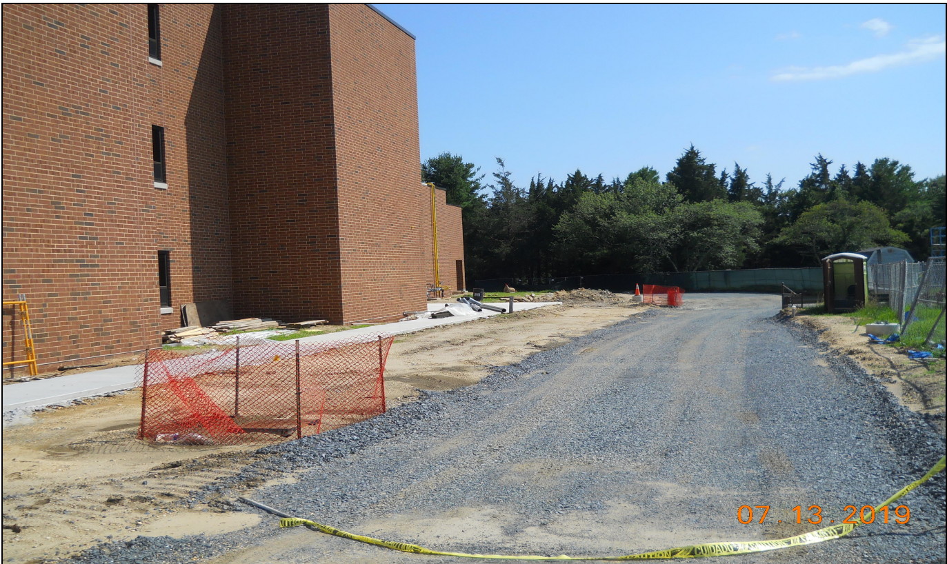
Pinelands Regional Sr. High School 6 Rear Service Road Subgrade Installation