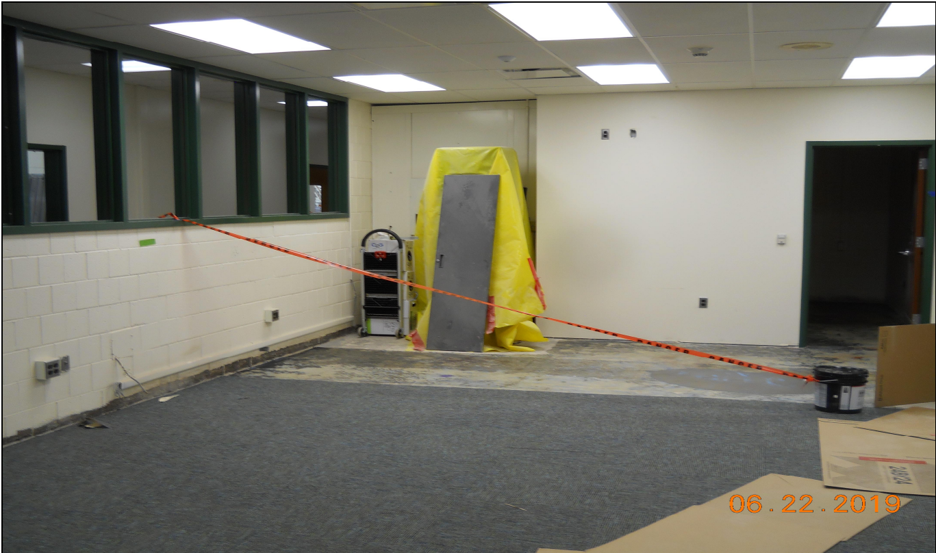
Pinelands Regional Sr. High School 6 Main Office Carpet Installation