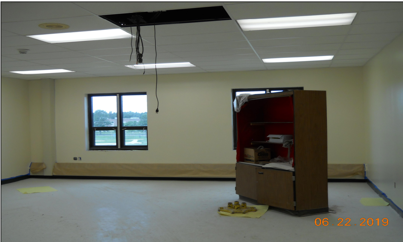
Pinelands Regional Sr. High School 6 Classroom Interior (Block A North 3 rd Floor)