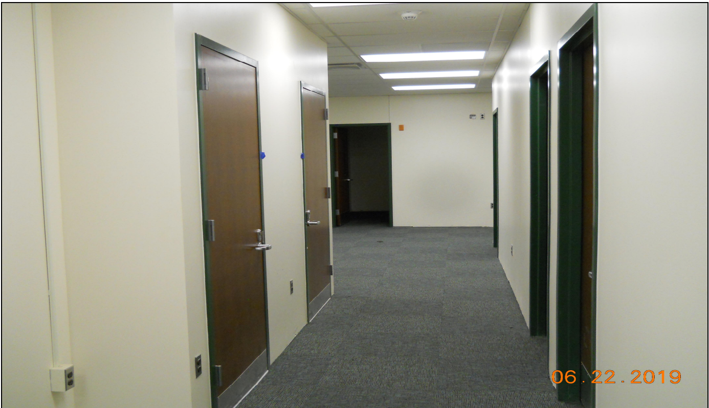
Pinelands Regional Sr. High School 6 Main Office Carpet Installation