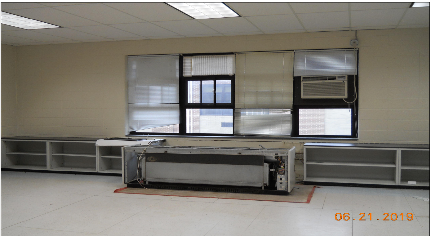
Pinelands Regional Jr. High School 6 Demolition / Removal of Classroom HVAC Unit (Block C)