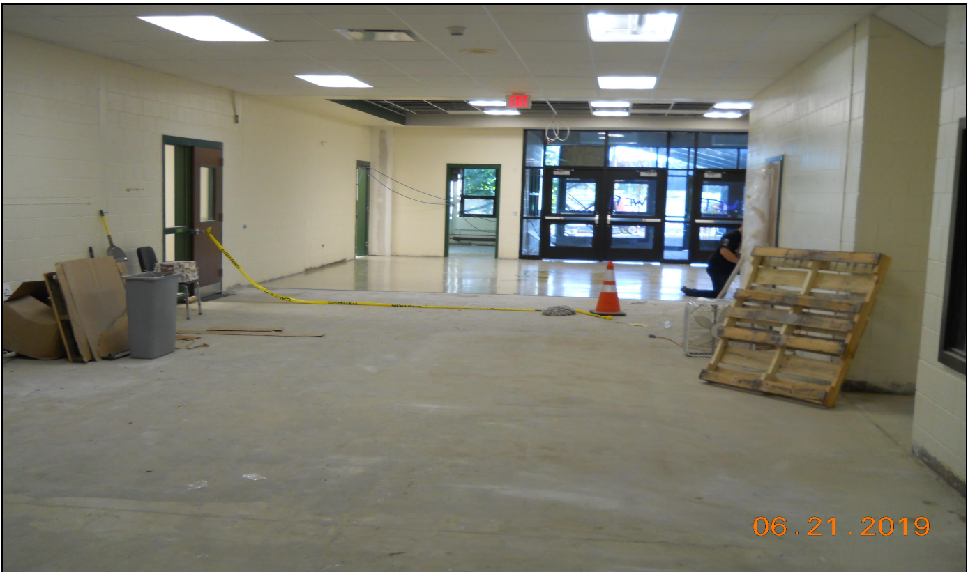
Pinelands Regional Sr. High School 6 Main Entrance Security Vestibule