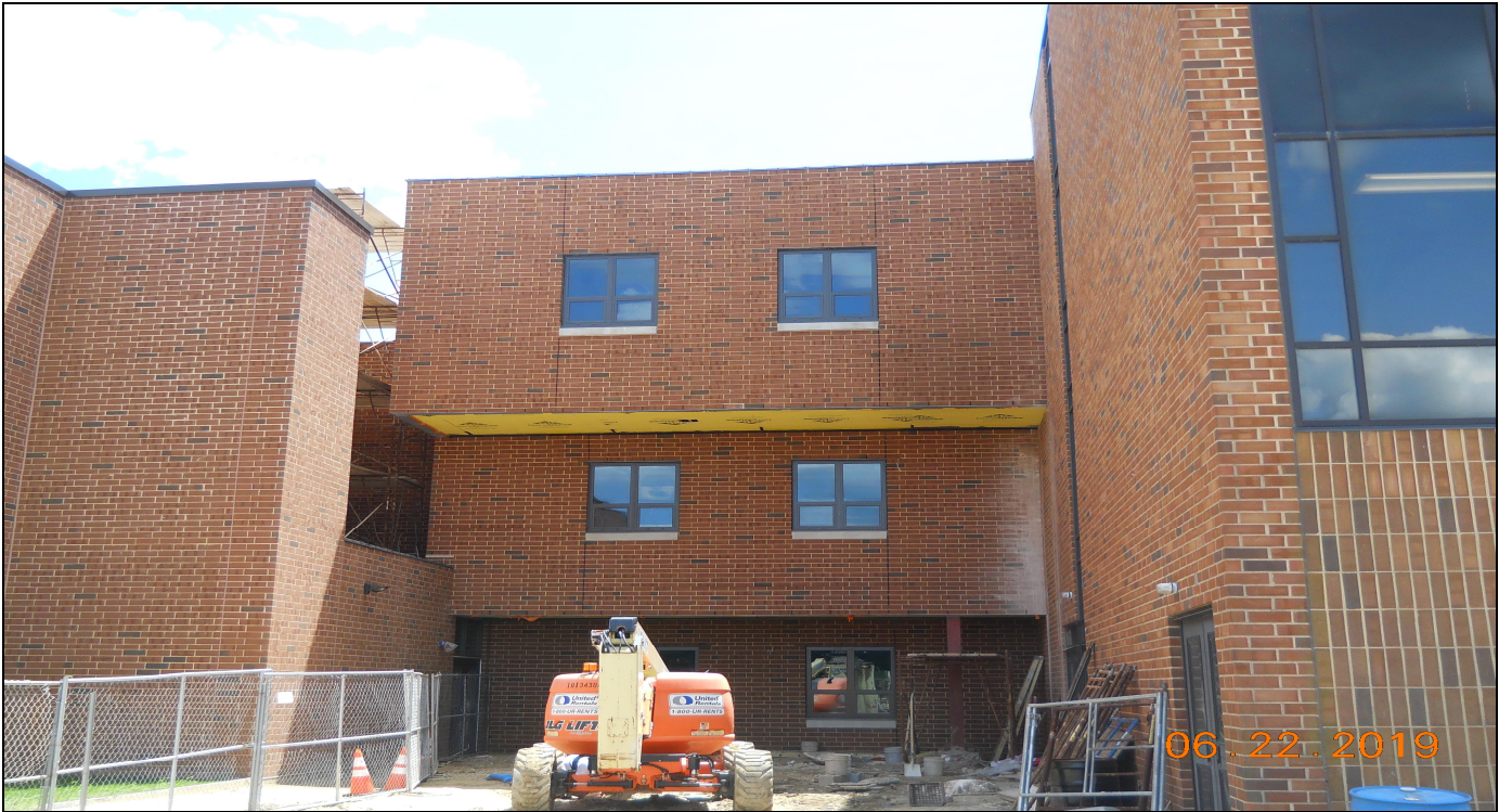
Pinelands Regional Sr. High School 6 Exterior Masonry Installation (Block A North)