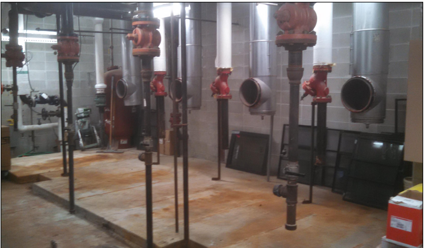
Pinelands Regional Jr. High School 6 Heating Plant Equipment Demolition & Removal