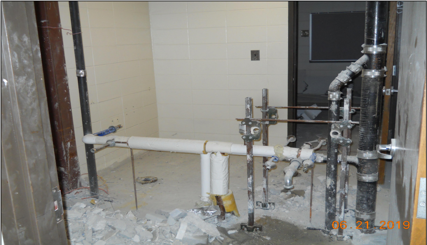
Pinelands Regional Jr. High School 6 Classroom Bathroom Demolition