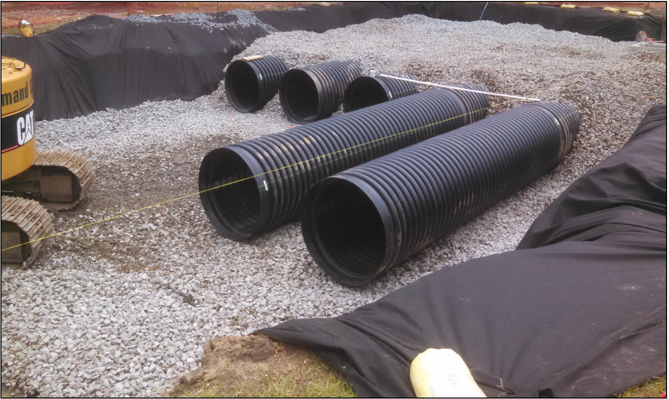
Pinelands Regional Sr. High School 6 Storm-water Management System