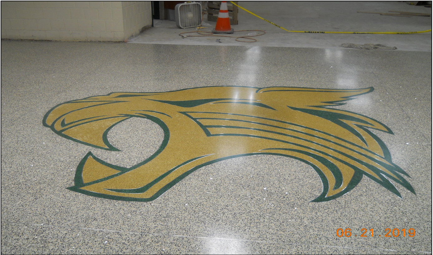
Pinelands Regional Sr. High School 6 Main Entrance 6Wild Cats6 Terrazzo Flooring