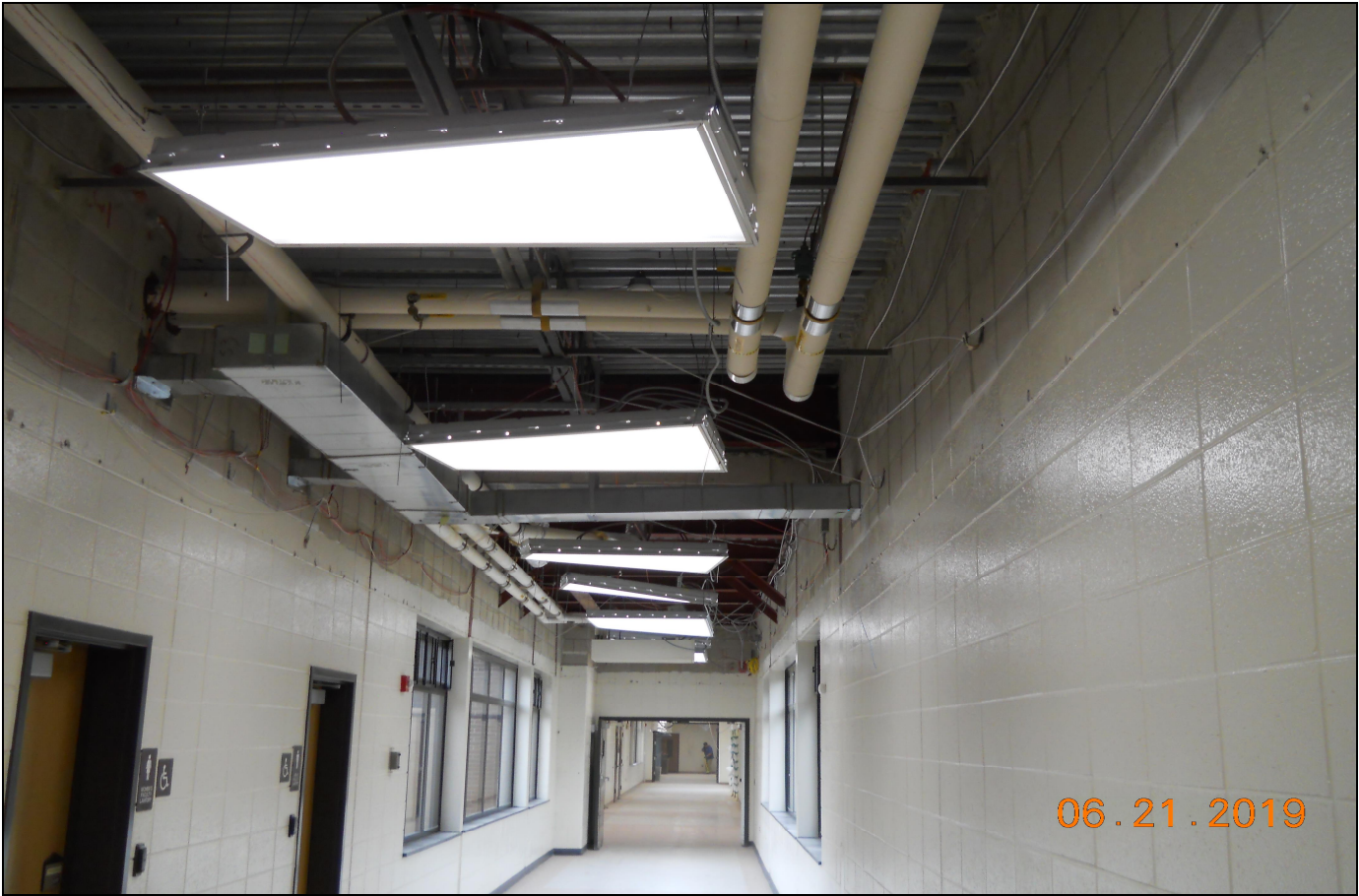
Pinelands Regional Jr. High School 6 Corridor Ceiling System Demolition & Removal (2 nd Floor)