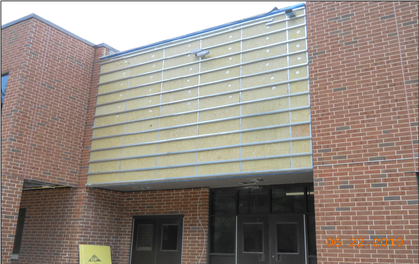
Pinelands Regional Sr. High School 6 Exterior Facia Preparation / Insulation (Block A South)