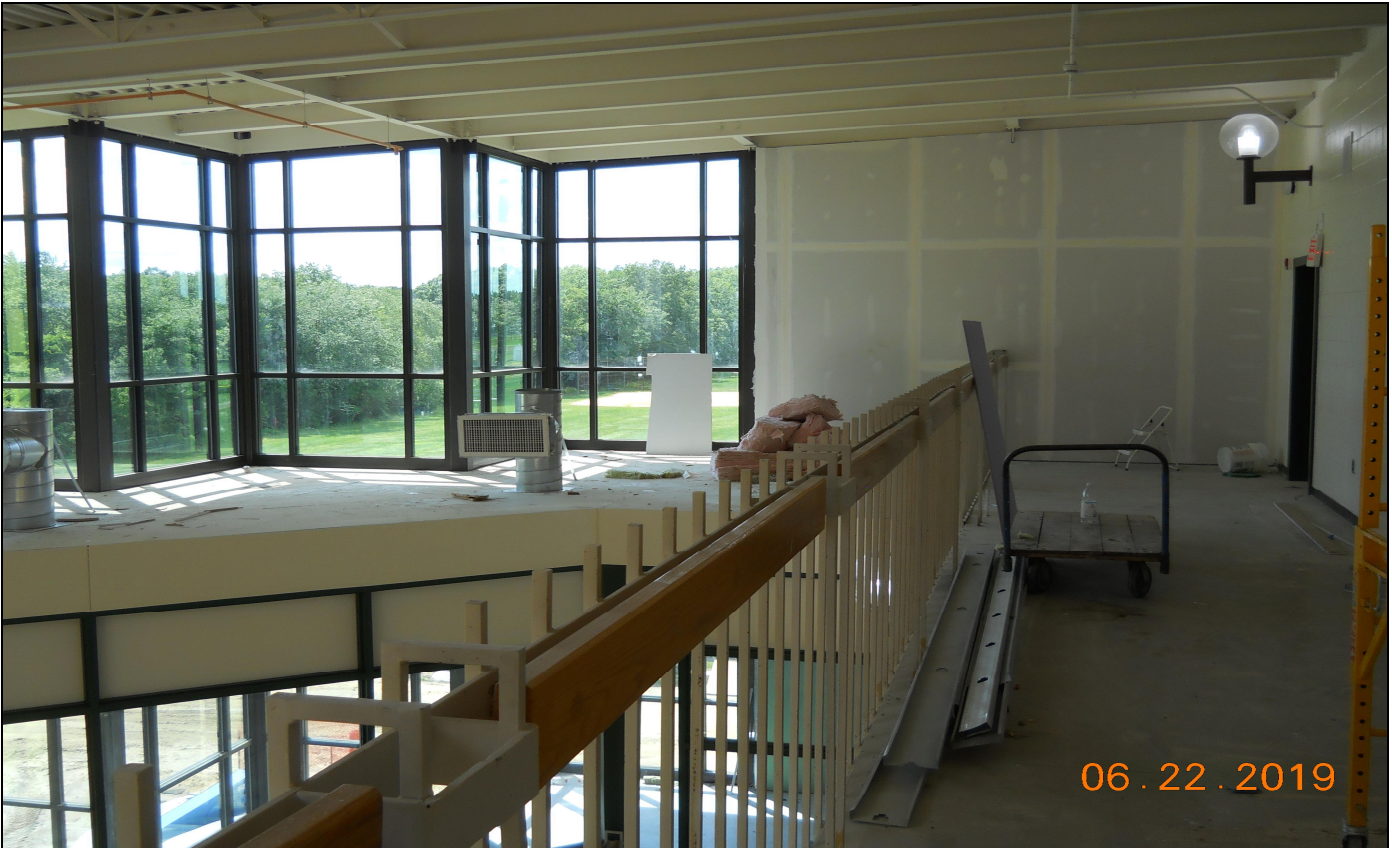
Pinelands Regional Sr. High School 6 Atrium Exterior Elevation (Block A West)