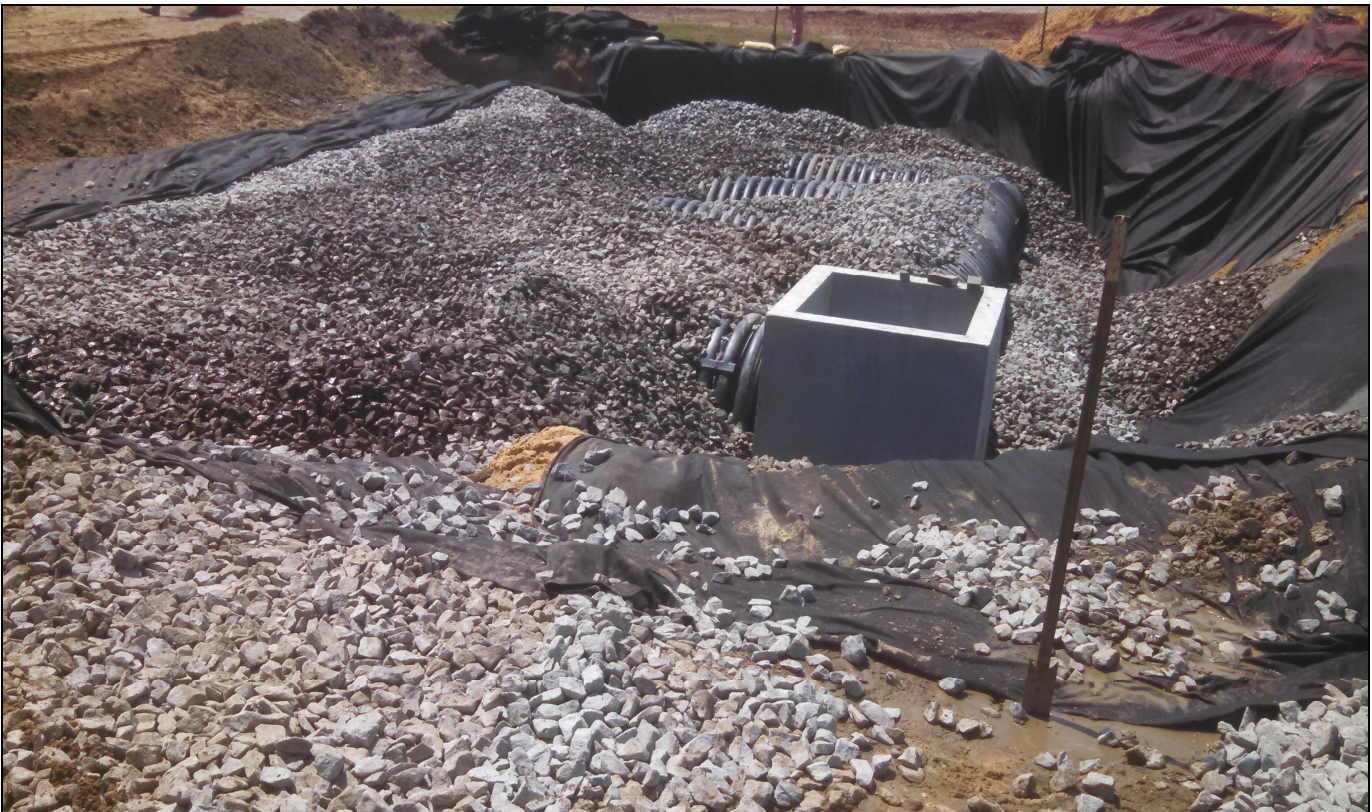
Pinelands Regional Sr. High School 6 Storm-water Management System