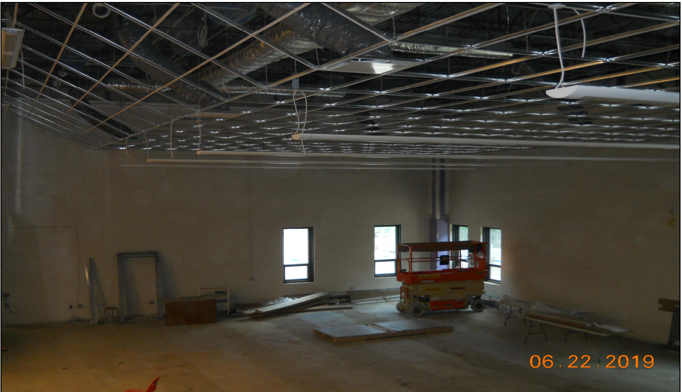
Pinelands Regional Sr. High School 6 Media Center Ceiling Light Fixtures