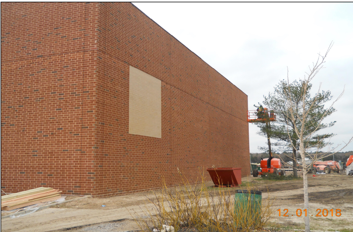
Pinelands Regional Sr. High School □ Exterior Masonry Waterproofing / Brick Veneer Installation