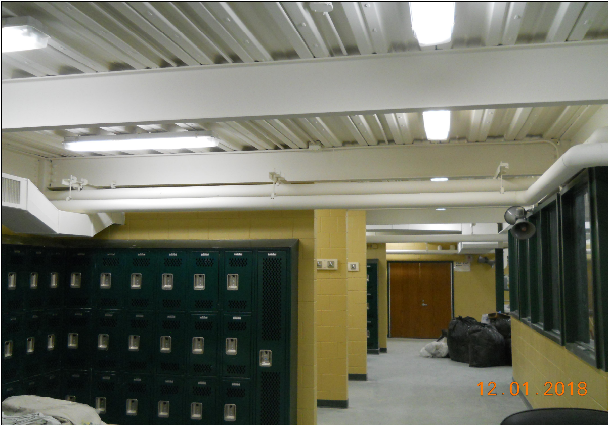
Pinelands Regional Sr. High School □Locker Room (Ceiling Painting / Ductwork)