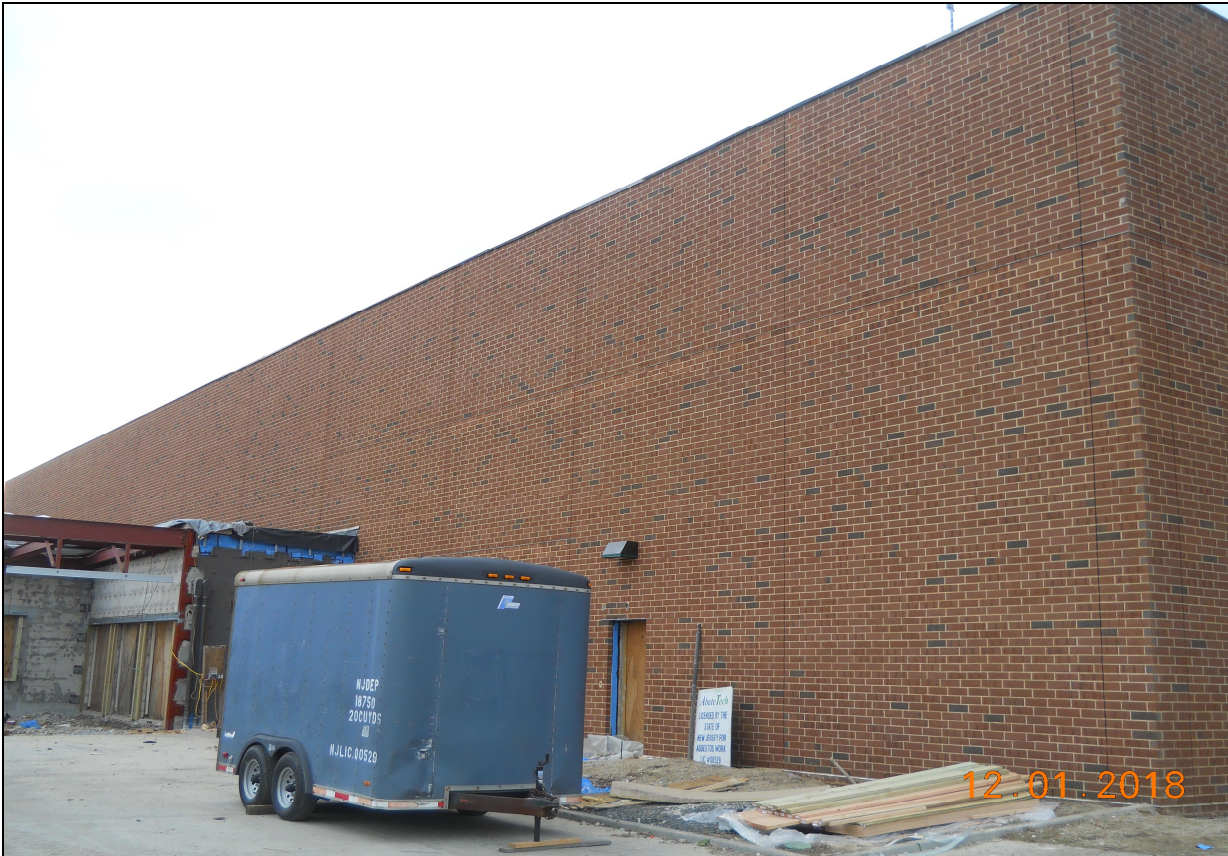
Pinelands Regional Sr. High School □ Exterior Masonry Waterproofing / Brick Veneer Installation