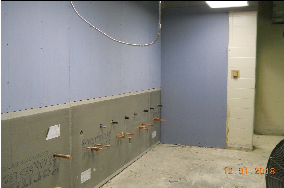
Pinelands Regional Jr. High School- 1 st Floor Bathroom Renovations (Student)