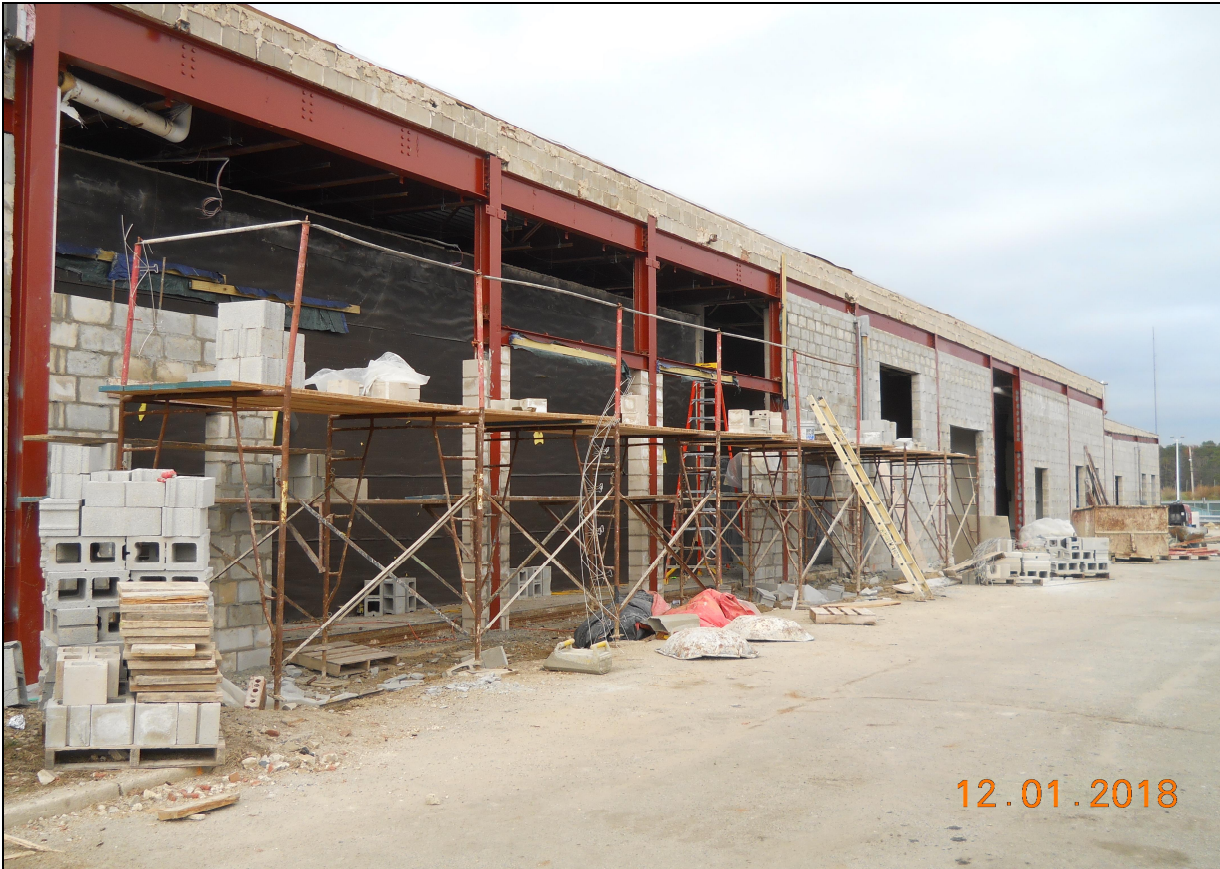
Pinelands Regional Sr. High School □ Exterior Masonry Installation (D-Wing East)