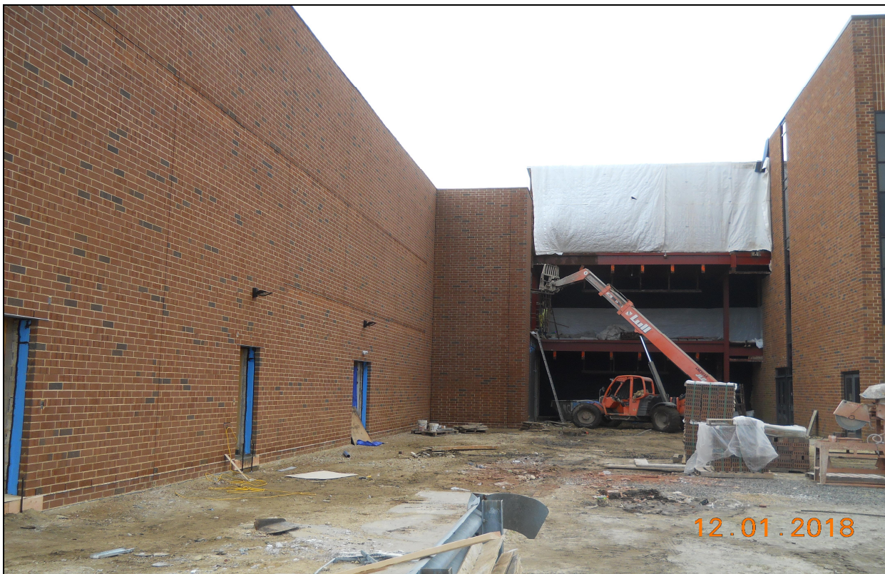
Pinelands Regional Sr. High School □ Exterior Masonry Waterproofing / Brick Veneer Installation