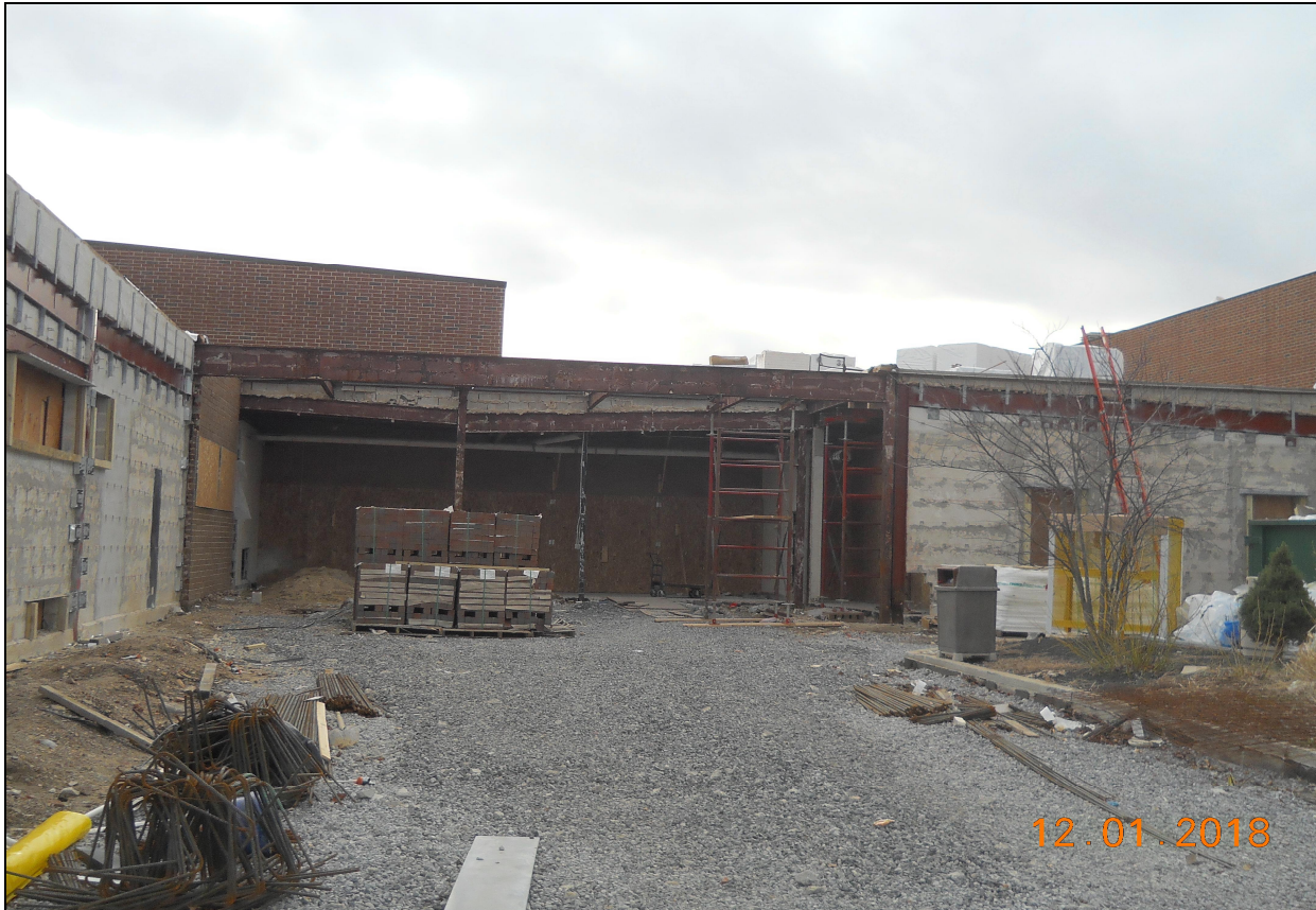
Pinelands Regional Sr. High School □ Exterior Masonry Waterproofing / Brick Veneer Installation