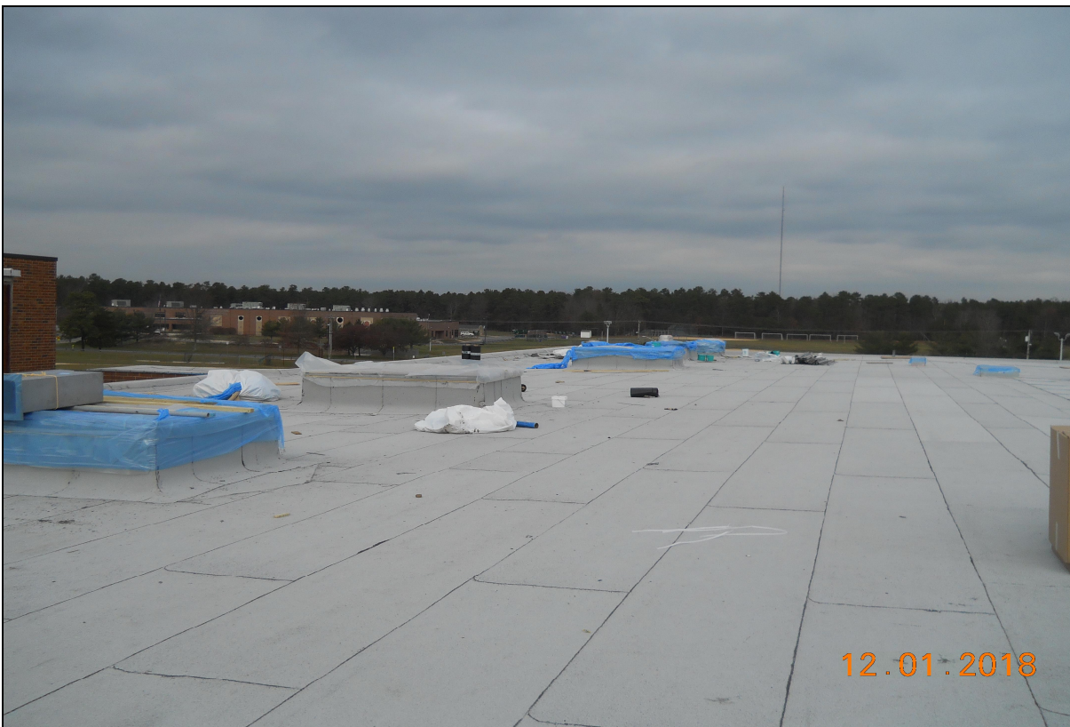
Pinelands Regional Sr. High School Gym Roof □New HVAC Unit Curbs