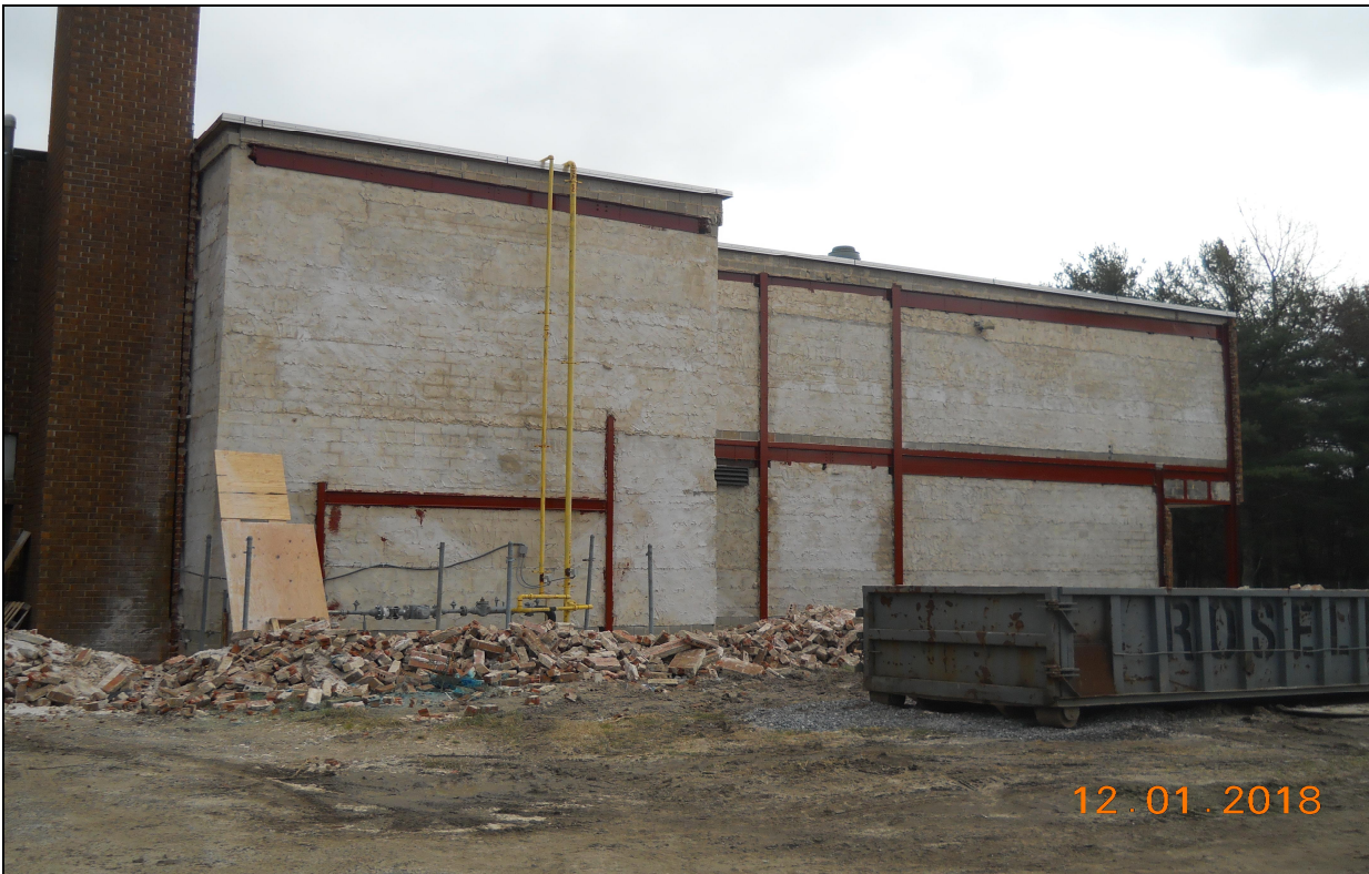
Pinelands Regional Sr. High School □ Exterior Masonry Facia Demolition (A-Wing)