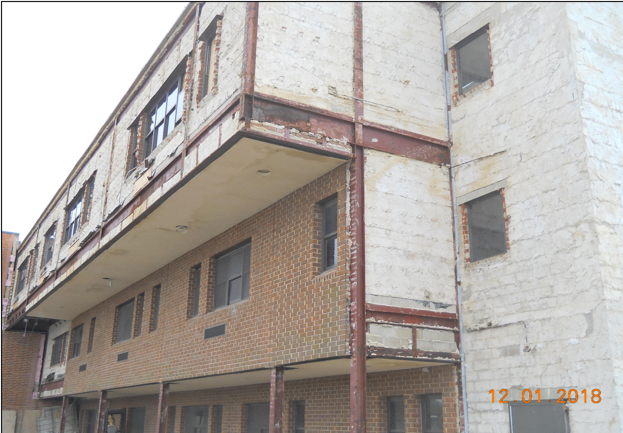
Pinelands Regional Sr. High School □ Exterior Masonry Facia Demolition (A-Wing)