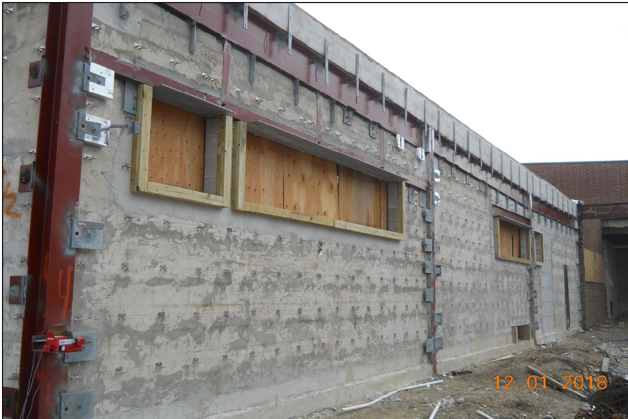
Pinelands Regional Sr. High School □ Exterior Masonry / Steel Installation (D-Wing East)