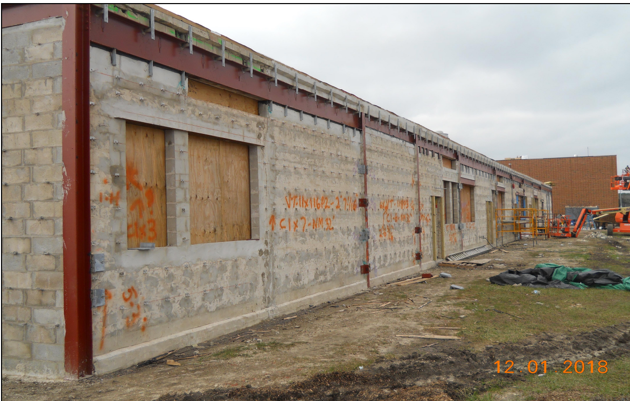
Pinelands Regional Sr. High School □ Exterior Masonry / Steel Installation (D-Wing East)