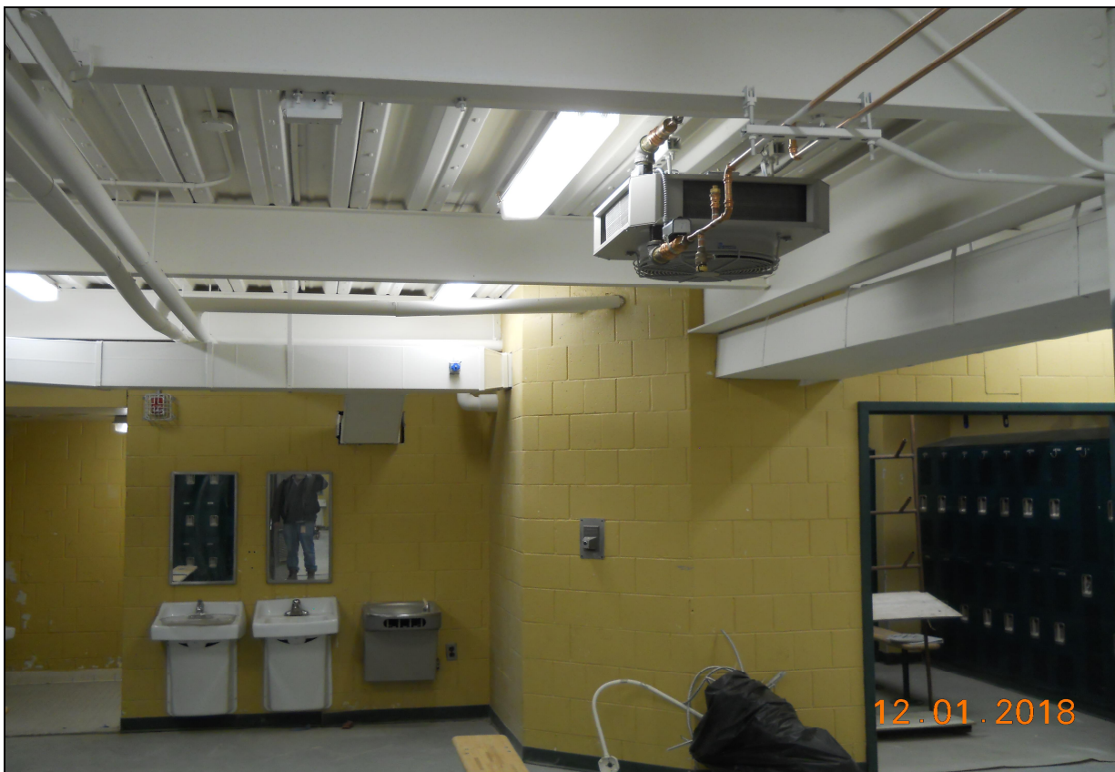
Pinelands Regional Sr. High School □ Locker Room (Ceiling Painting / Ductwork)