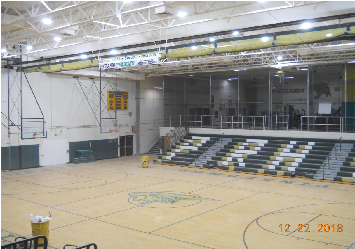
Pinelands Regional Sr. High School 6 Gym Interior