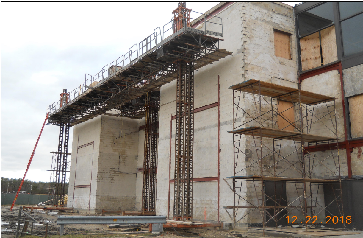
Pinelands Regional Sr. High School 6 Exterior Masonry Preparation (A-Wing West)