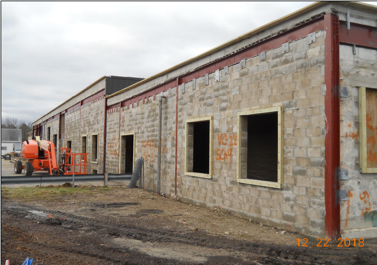
Pinelands Regional Sr. High School 6 Exterior Masonry Preparation (D-Wing East)