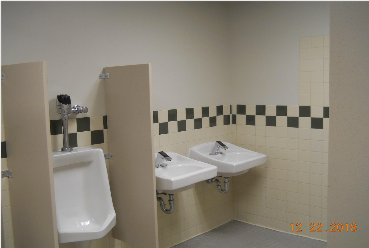
Pinelands Regional Sr. High School 6 Student Bathroom (Gym Corridor)