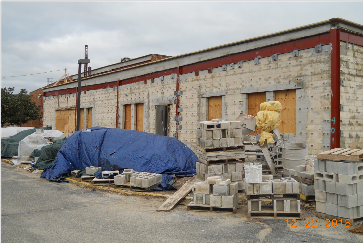
Pinelands Regional Sr. High School 6 Exterior Wall Preparation (D Wing South)