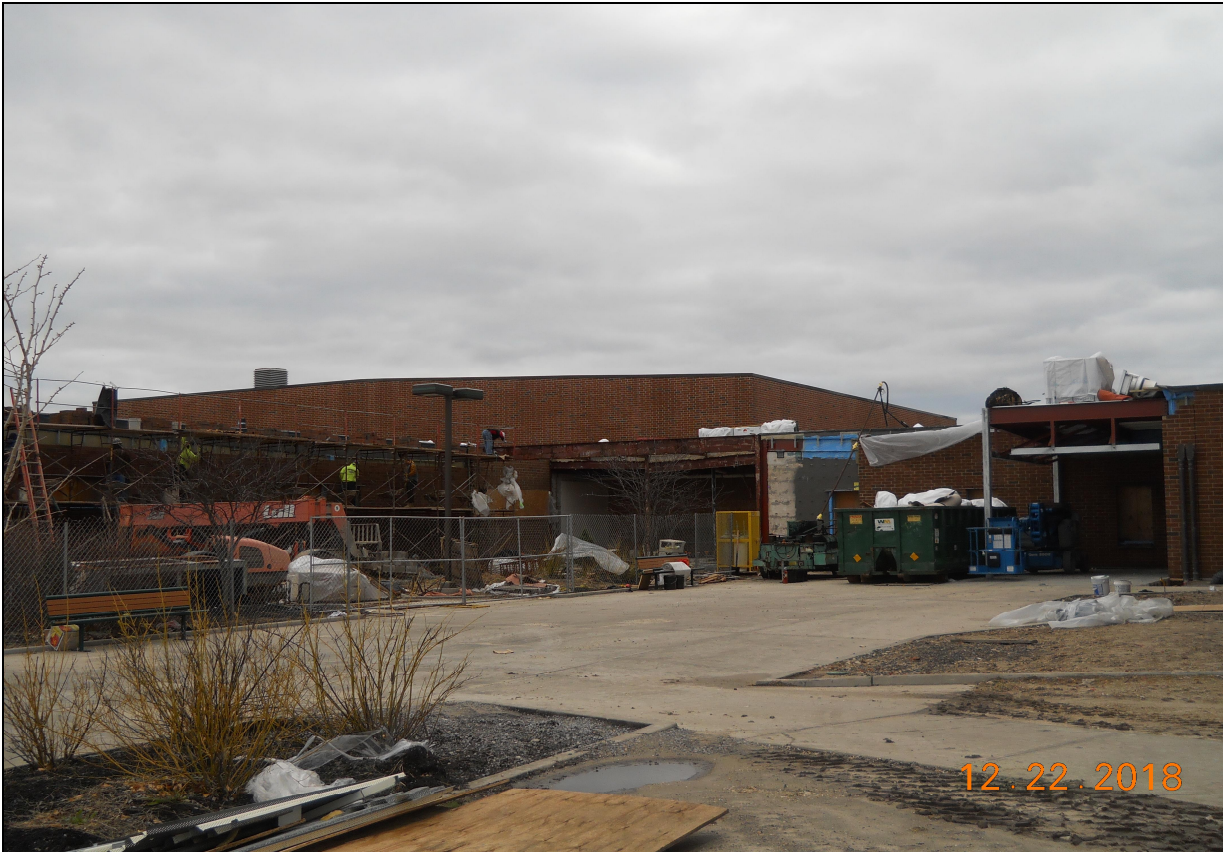
Pinelands Regional Sr. High School ó New Gym Entrance & Canopy