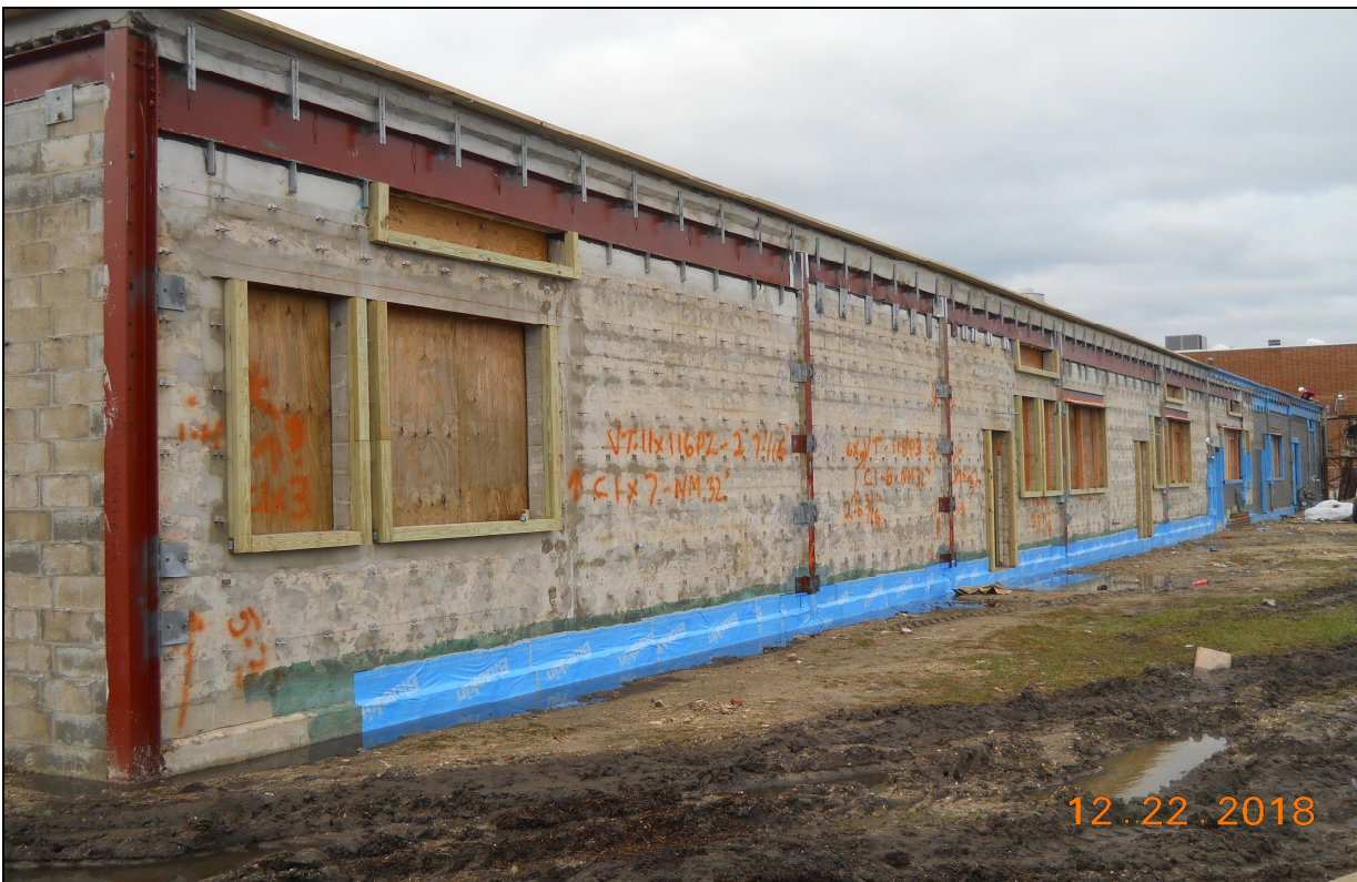
Pinelands Regional Sr. High School 6 Exterior Masonry Waterproofing (D-Wing North)