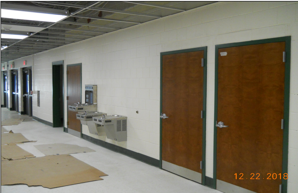
Pinelands Regional Sr. High School Gym Corridor