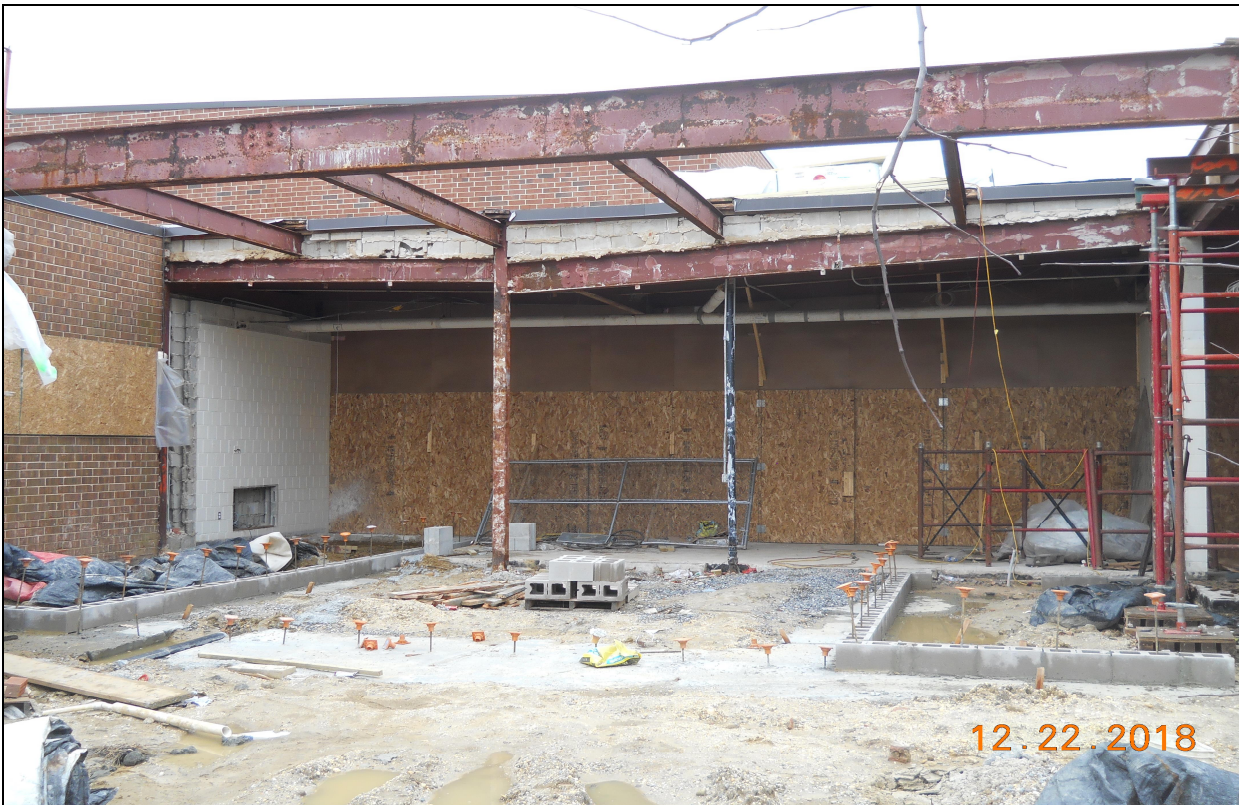
Pinelands Regional Sr. High School 6 New Main Entrance Addition