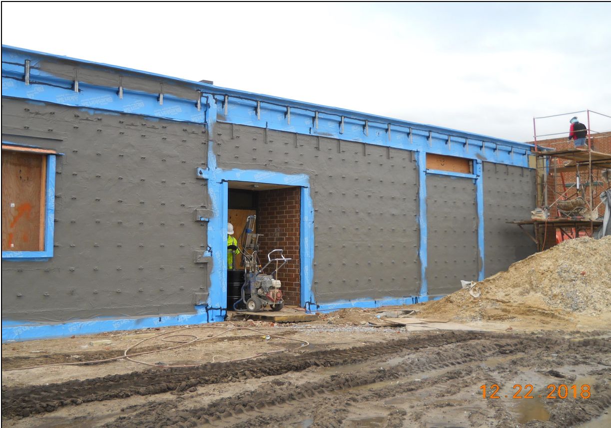
Pinelands Regional Sr. High School 6 Exterior Masonry Waterproofing (D-Wing North)