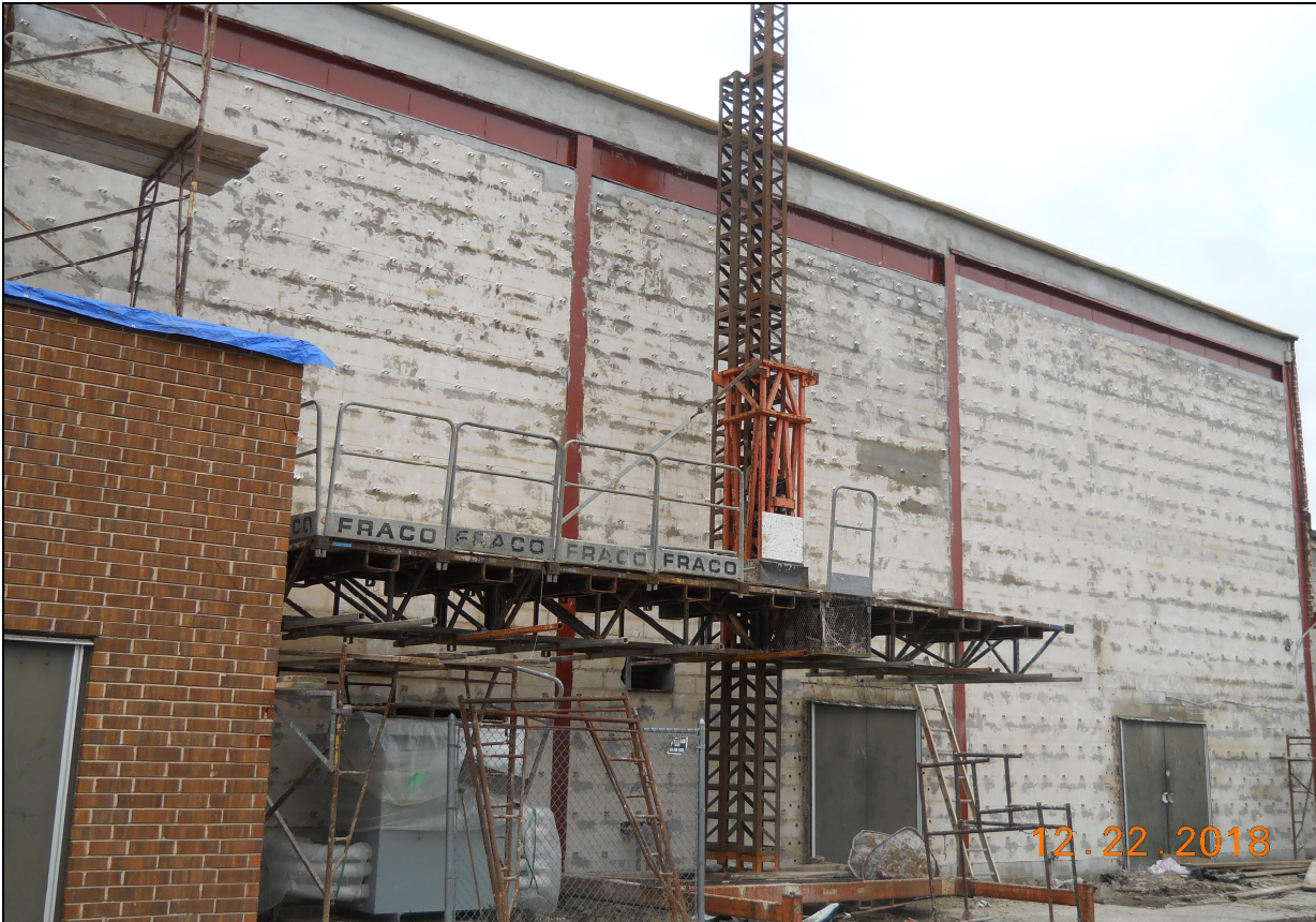
Pinelands Regional Sr. High School 6 Exterior Wall Preparation (Auditorium South)