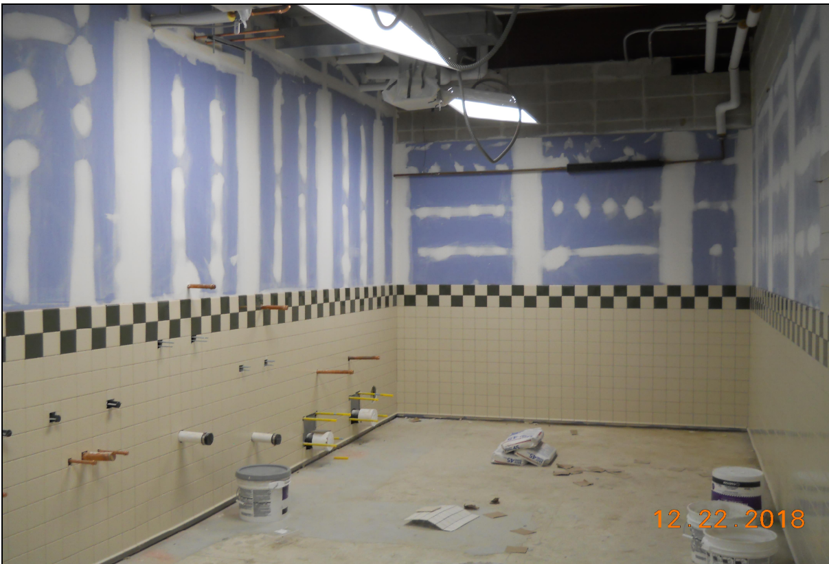
Pinelands Regional Jr. High School 6 1 st Floor Student Bathroom