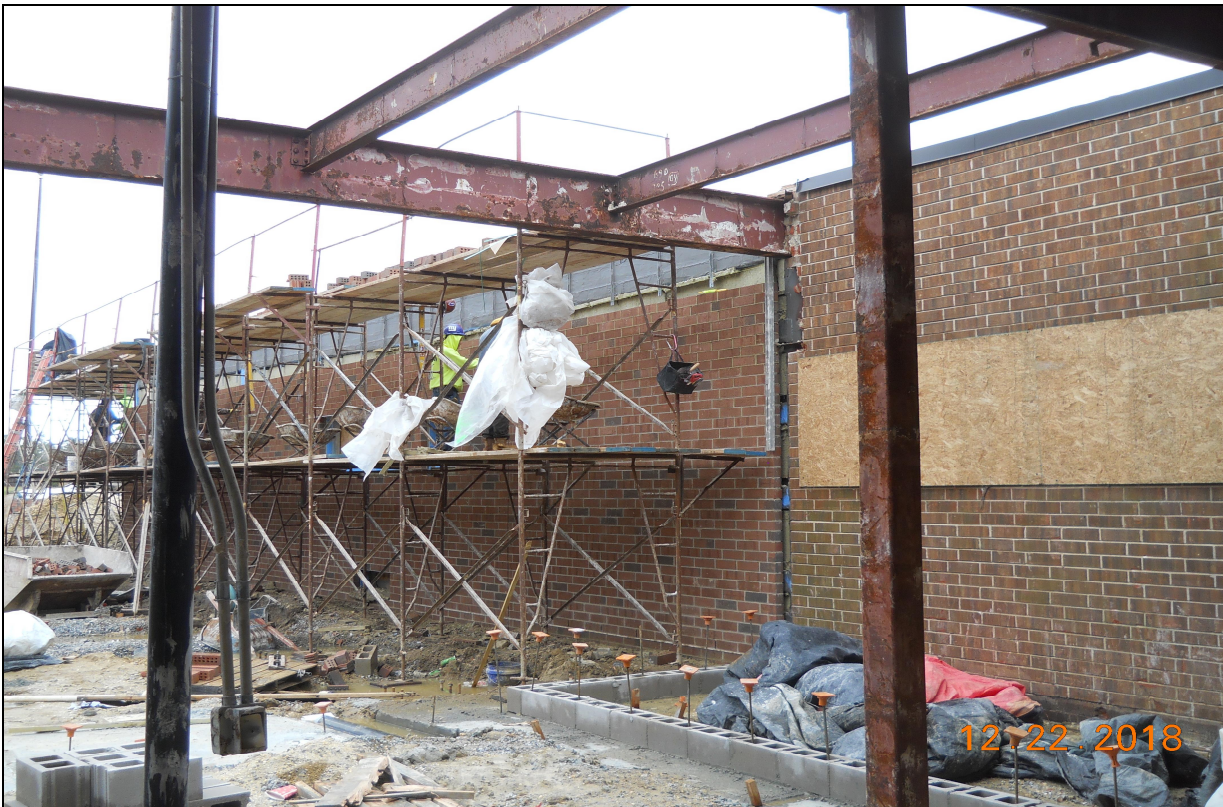
Pinelands Regional Sr. High School ó Exterior Masonry Installation (D-Wing West)