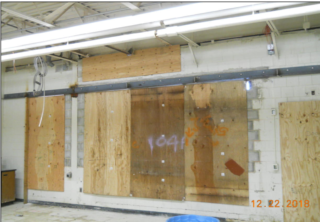
Pinelands Regional Sr. High School 6 Structural Steel Installation (D Wing North)