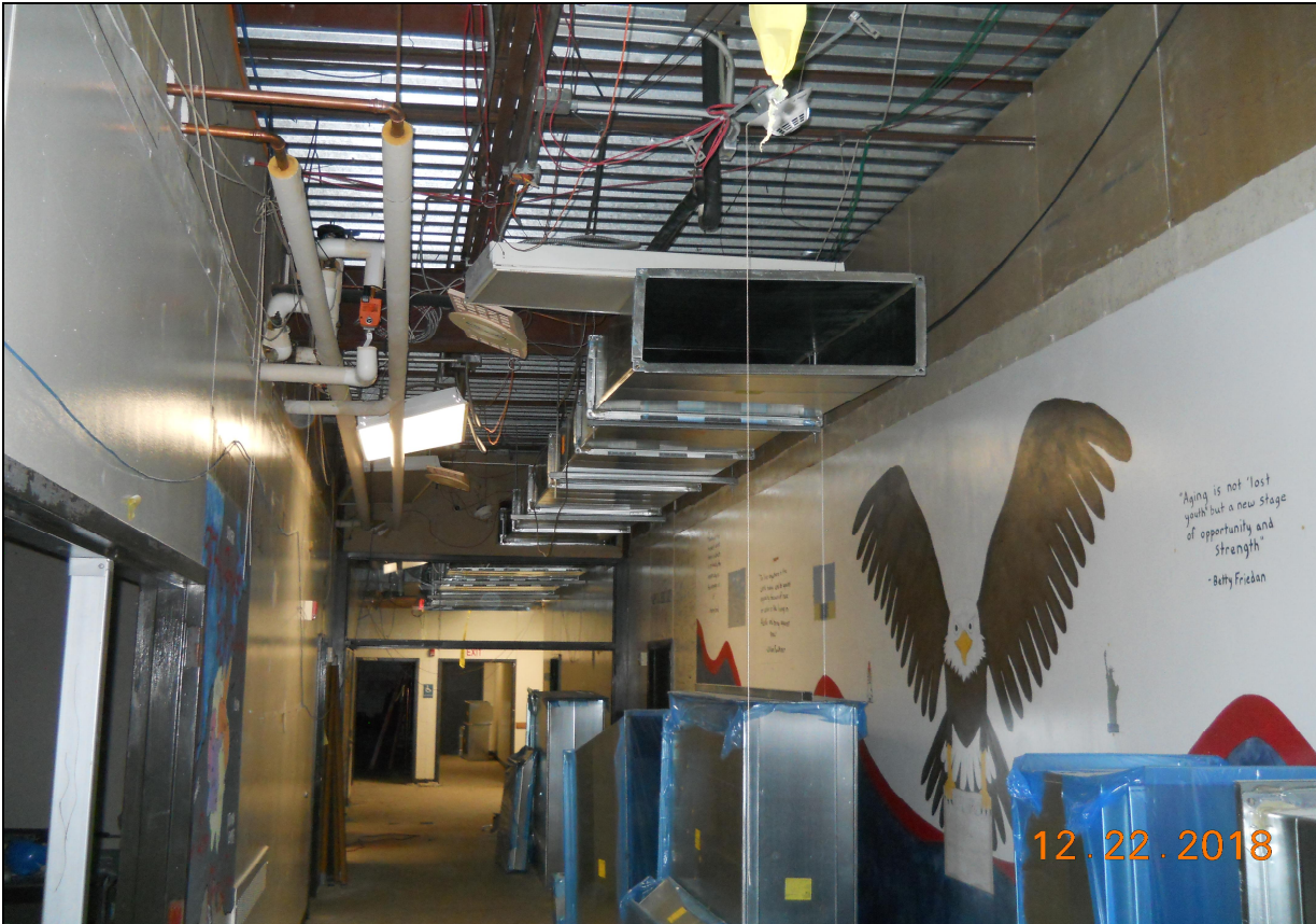
Pinelands Regional Sr. High School 6 3 rd Floor HVAC Ductwork Installation